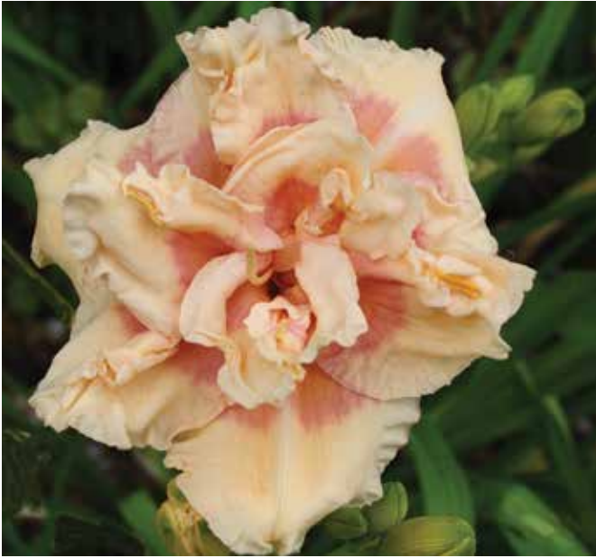
H. 'Big Kiss' (Joiner) Dip: 28", 5.5" double; HM 2002, AM 2005