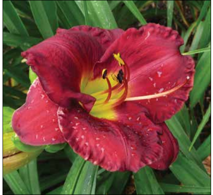
H. 'Jovial' (Gates-L. 1986)

an AM in 1996. Among his tetraploids winning HMs alone were 'Shaman' (1985), a 20", 5.5" canary yellow self with a green throat, in 1989; 'Jovial' (1986), a 20", 5" wine red self with a chartreuse green throat, in 1990; 'Ultra Plum' (1986), a 20", 5.5" plum purple with darker eyezone and green throat, in 1991; 'Excitable' (1986), a 20", 5.5" double rose pink self with a green throat, in 1992; 'Shared Excitement' (1986), a 20", 6" green yellow blend with a green throat, in 1993; 'Snow Bride' (1986), a 20", 5" diamond dusted near white with a