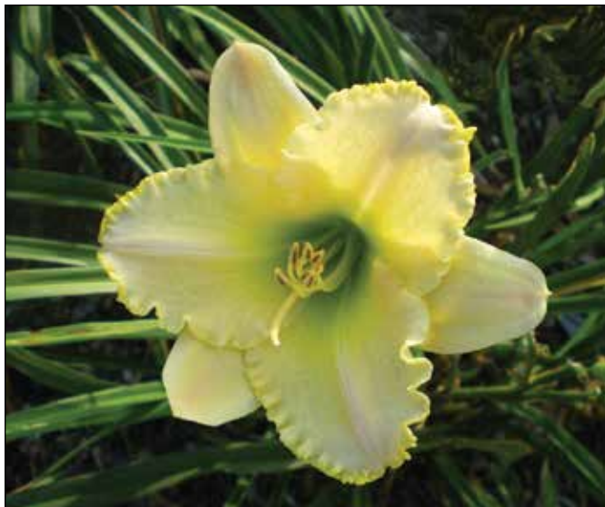
H. 'Fragrant Bouquet' (Reckamp-Klehm 1989)