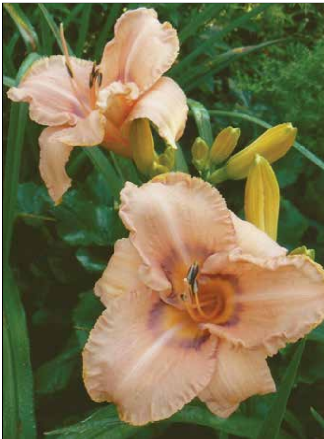
H. 'Penny Arcade' (Sellers 1989)

in 1992. Yet another diploid from the 1980s, 'Vegas Lights' (1989) a 20", 6" bright red blend with a dark red eyezone and a yellow throat, won an HM in 1994. Three more of his tetraploids also received honors, including 'Second Glance' (1984), a 28", 6" persimmon blend with a green throat, which won an HM in 1988; 'Prince Redbird' (1986), a 26", 3.5" red self with a green throat, which won an HM in 1993; and 'Penny Arcade' (1989), a 26", 5" orange apricot blend with a purple eyezone and a flaming orange throat, which won an HM in 1996. 'Early Look' (1989), a 28", 5.5" pink blend with a yellow green throat, however, remains overlooked. In all, Van Sellers is credited with 324 registrations. He was honored with the Bertrand Farr Silver Medal in 1987.