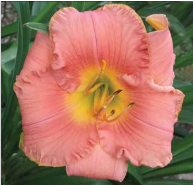
H. 'Silken Touch' (Stamile 1990)