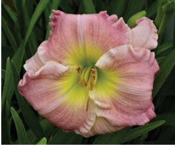
H. 'Pink Scenario' (Sikes) Dip: 19", 5.5"; HM 1997