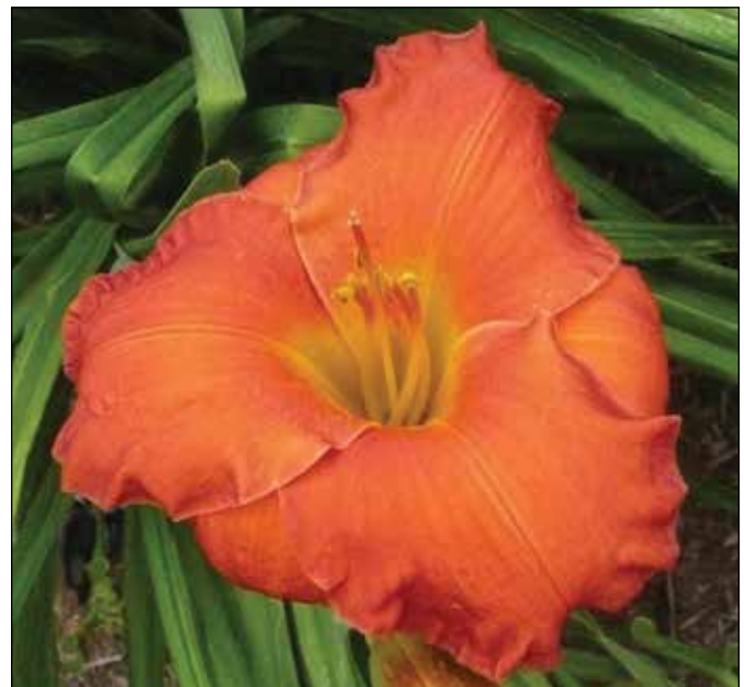
H. 'House of Orange' (Weston 1990)