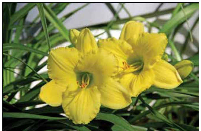
H. 'Atlanta Full House' (Petree 1984)