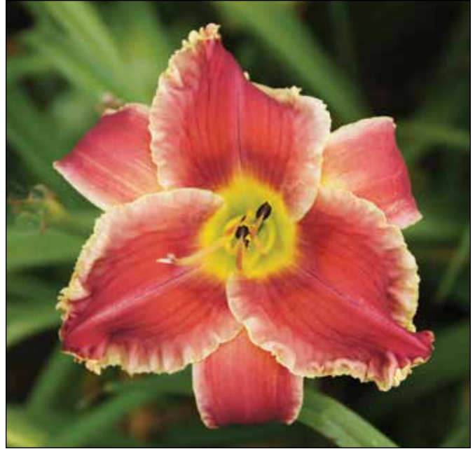
H. 'Startle' (Belden 1988)

Ron Rose of East Taunton, Massachusetts, registered only four cultivars. His diploid H. 'Blueberry Breakfast' (1988), a 22", 5" slate lavender with wide magenta purple mid-ribs and a deep purple eyezone above a green throat, gained popularity and won an HM in 2002.