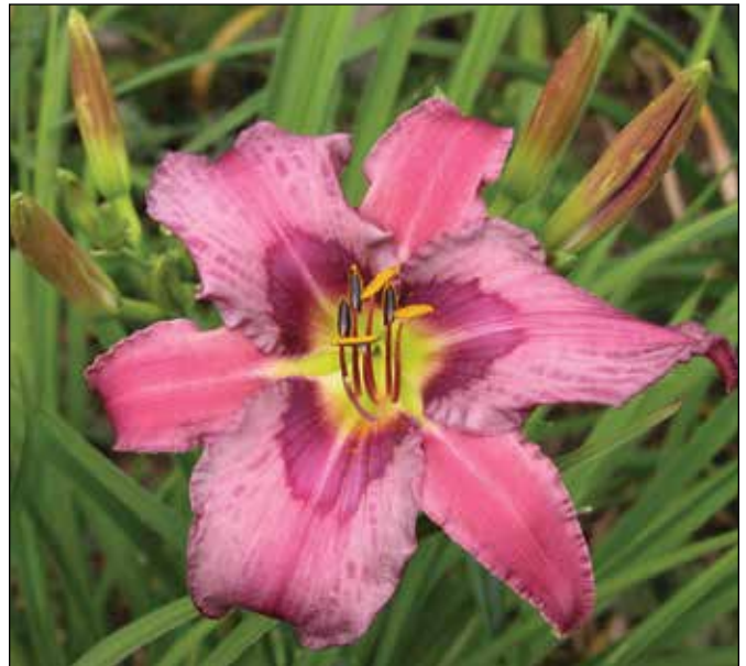
H. 'Blueberry Breakfast' (Rose 1988)