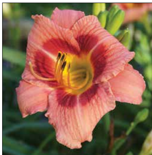
H. 'Decatur Cherry Smash' (Davidson 1981)

Clyde Davidson of Decatur, Georgia, continued registering his "Decatur" series of tetraploid daylilies into the 1980s. H. 'Decatur Cherry Smash' (1981), a 26", 4" medium pink with a cherry eyezone and a yellow green throat, won an HM in 1986. 'Decatur Double Dandy' (1981), a 32", 5" double medium red self with a yellow throat, however, remains overlooked. 'Decatur Piecrust' (1982), a 22", 5" salmon pink self, won an HM in 1985. 'Decatur Double Delight' (1983), a 26", 6.25" double light yellow self, remains overlooked.