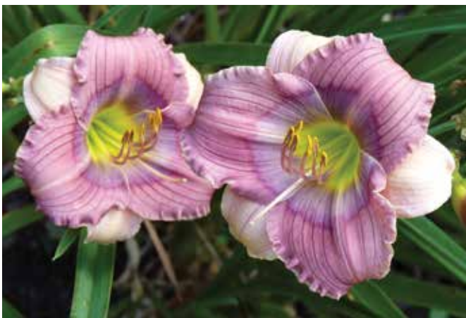
H. 'Siloam Tiny Tim' (Henry-P. 1984)

pinkish beige with a deep rose eyezone and green throat, won an HM in 1984. 'Siloam Show Girl' (1981), an 18", 4.25" red with a deep red eyezone and a green throat, also won an HM in 1984. 'Siloam Sambo' (1982), a 24", 4" black red self with a bright green throat, won an HM in 1992. Something of a departure in size, 'Siloam Mama' (1982), a 24", 5.75" yellow self with a green throat, won an HM in 1985; 'Siloam Medalion' (1982), a 26", 6.5" yellow self with a green throat, won an HM in 1992; and 'Siloam Harold Flickinger' (1983), a 26", 6" yellow pink blend with a green throat, won an HM in 1988. 'Siloam Royal Prince' (1983), a 19", 4" red purple self with a green throat, won an HM in 1986. 'Siloam Tiny Tim' (1984), a 14", 3" blue purple blend with a deep purple and smoky blue eyezone above a green throat, won an HM in 1988. 'Siloam Betty Woods' (1984), an 18", 5" double pink self with a green