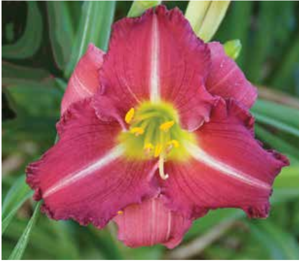
H. 'Herman Apps' (Apps) Dip: 28", 5.5"; HM 1996