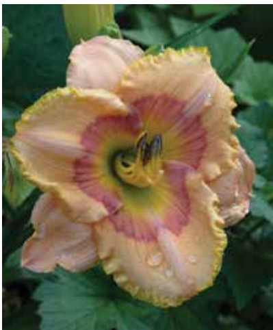
H. 'April in Paris' (Moldovan) Tet: 22", 4.5"; HM 2002