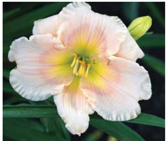
H. 'Cindy Ann' (Crochet) Dip: 22", 5.5"; HM 1996