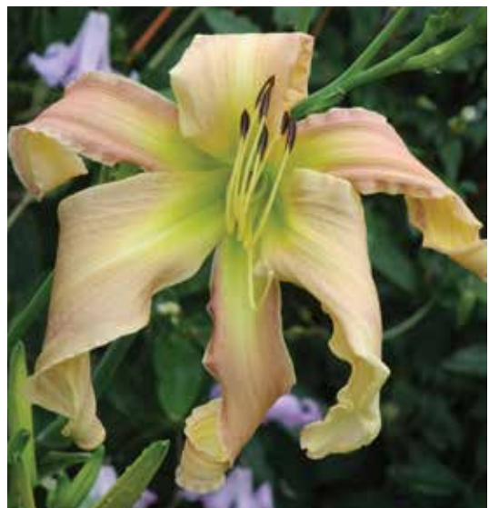
H. 'Lola Branham' (Burkey) Dip: 38", 7.5" unusual form crispate; HM 1999, L/W Award 2003