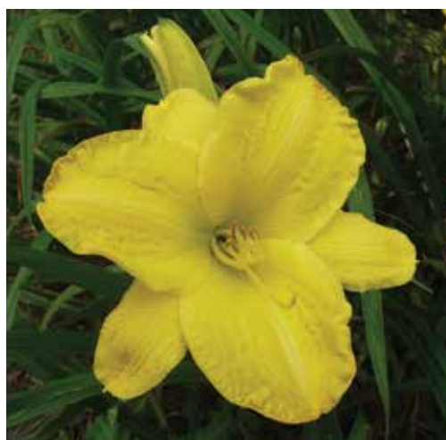
H. 'Deloris Gould' (Gould) Tet: 25", 5"; HM 1998