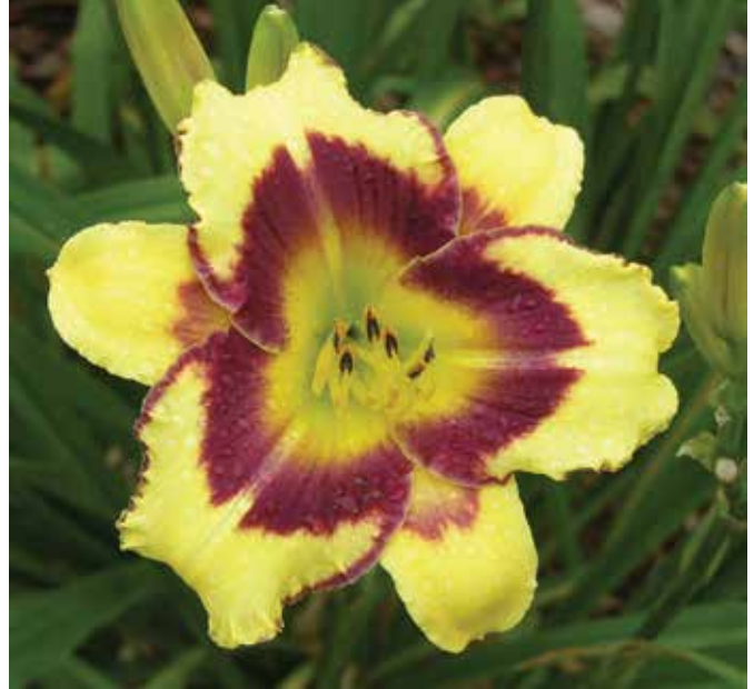
H. 'El Desperado' (Stamile) Tet: 28", 5"; HM 1997, PC 2000, AM 2000, Don C. Stevens 2001