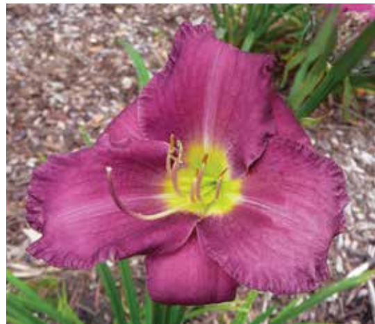
H. 'Woodside Rhapsody' (Apps) Dip: 31", 4"; HM 1998