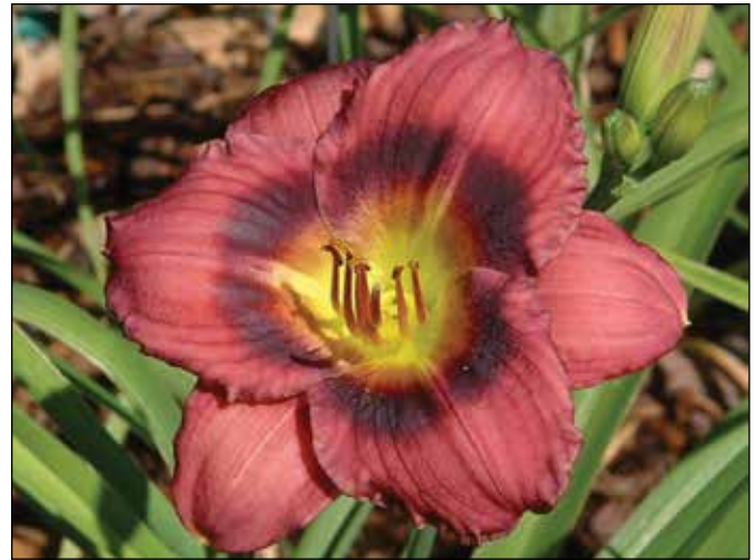
H. 'Gypsy Grapette' (Cruse 1986)