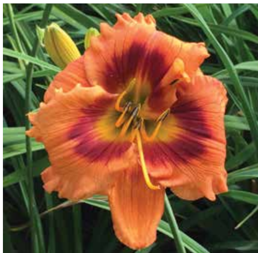
H. 'Bronze Eyed Beauty' ( J. Carpenter ) Dip: 24", 6"; HM 1997