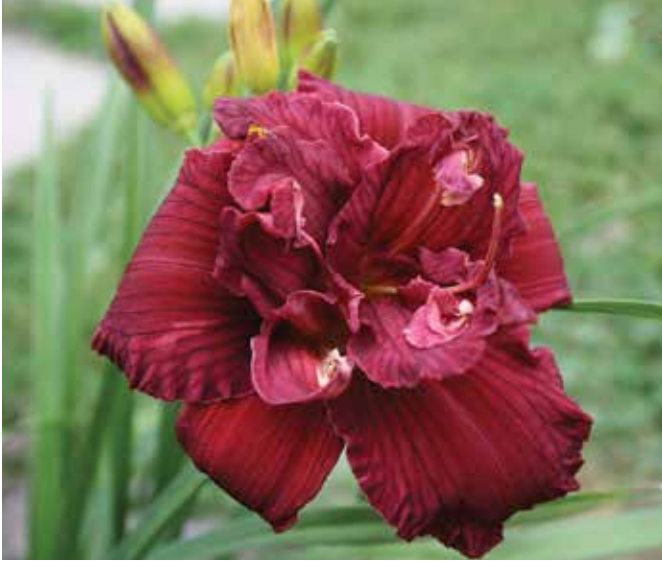
H. 'Double Cranberry Ruffles' (Talbot) Dip: 19", 5" double; HM 2004