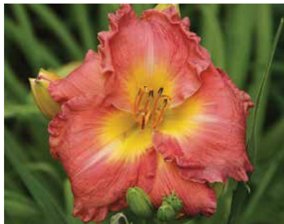
H. 'Dena Marie' (J. Carpenter) Dip: 26", 6.75"; HM 1997, LEP 1999, AM 2000