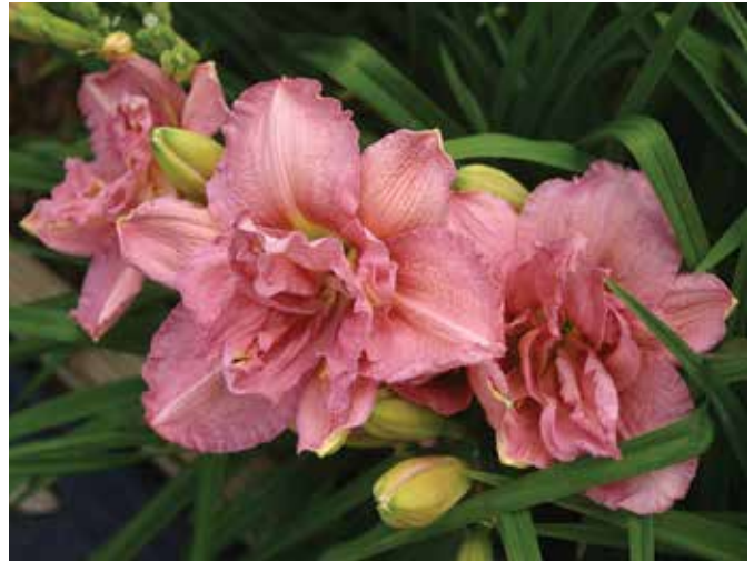
H. 'Charming Ethel Smith' (Terry) Dip: 20", 6" double; HM 1997