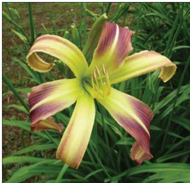
H. 'Lavender Spider' (Harris-Reinke 1990)