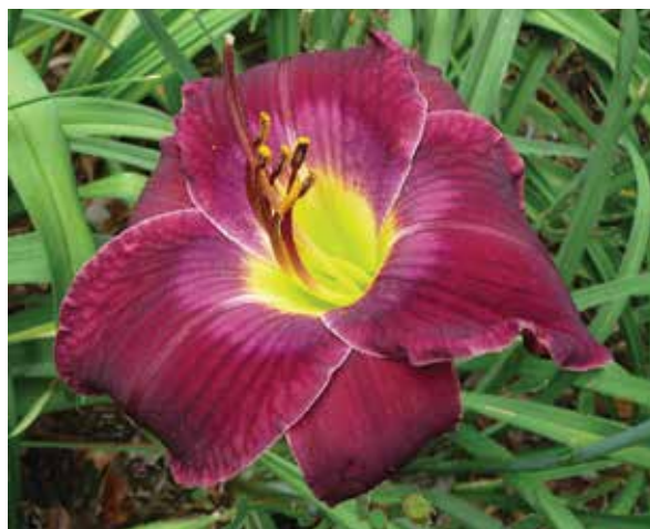
H. 'Nordic Night' (Salter) Tet: 24", 5"; HM 2003