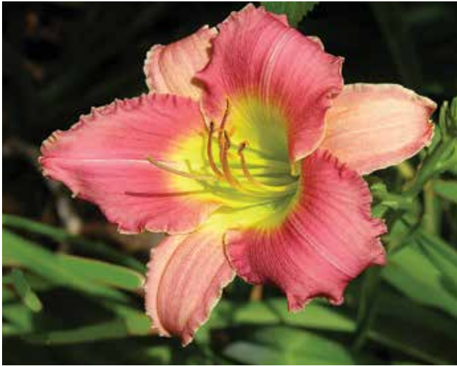
H. 'Final Touch' (Apps) Dip: 32", 4.75"; HM 1996