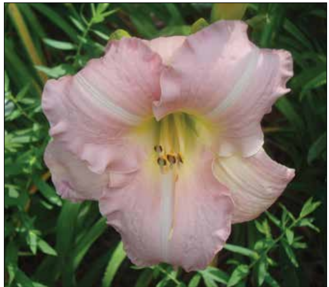
H. 'Frosted Pink Ice' ( Stamile 1987) (Photo by Marifran Hiltz)

orange throat, won an HM in 1992. 'Floyd Cove' (1987), a 21", 5" yellow self with a green throat, won an HM in 1990. 'Earth Angel' (1987), a 25", 4.5" apricot self with a green throat, won an HM in 1991. Two diploids from the same year were accorded awards: 'Frosted Pink Ice' (1987), a 28", 5" blue pink self with a green throat, won an HM in 1990 and the L. Ernest Plouf Award for fragrance in 1996; and 'Double Conch Shell' (1987), a 26", 6" double melon pink blend with a green throat, won an HM in 1991. 'Glory Days' (1987), a 24", 5.5" tetraploid gold self, won an HM in 1995. 'Wedding Band' (1987), a 26", 5.5" cream white edged yellow with a green throat, won an HM in 1990, an AM in 1993, and the Stout Silver Medal in 1996. 'Watermelon Moon' (1987), a 28", 6.5" watermelon pink blend with an orange throat, won an HM in 1992. 'Obsidian' (1988), a 27", 4.25" black self with a chartreuse throat, won an HM in 1992. 'Regal Finale' (1988), a 26", 6" violet purple self with a green throat, won an HM in