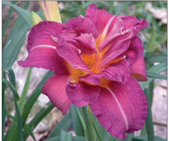
H. 'Double Blueberry Pie' (Betty Brown 1984)

'Blueberry Pie' (1984), an 18", 5.5" lavender blue self with an orange gold throat, won an HM in 1989. 'Double Peach Charmer' (1985), a 23", 5" peach with a light rose eyezone and rose throat, won an HM in 1991. 'Double Ladybug Ra'