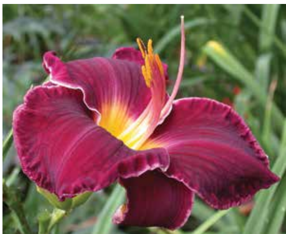
H. 'Noble Lord' (Moldovan) Tet: 30", 6"; HM 2002