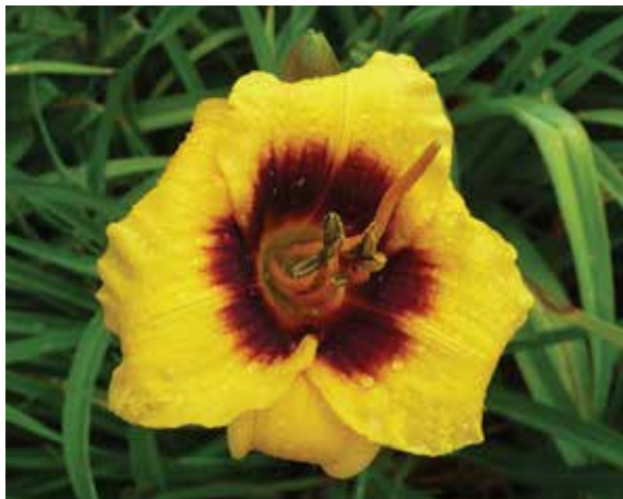
H. 'Lightning Bug' (Kroll) Dip: 16", 2.25"; Florida Sunshine Cup 2002