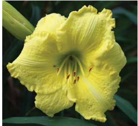
H. 'Omomuki' ( Stamile ) Tet: 26", 5"; HM 1995