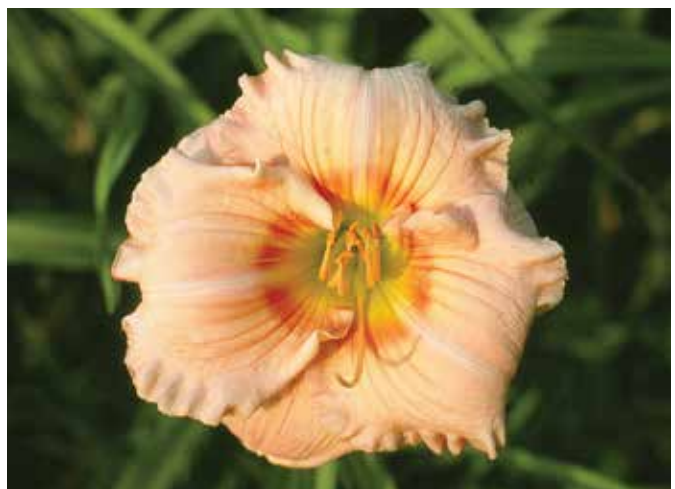
H. 'In Glad Adoration' (Billingslea) Dip: 22", 6"; HM 1998