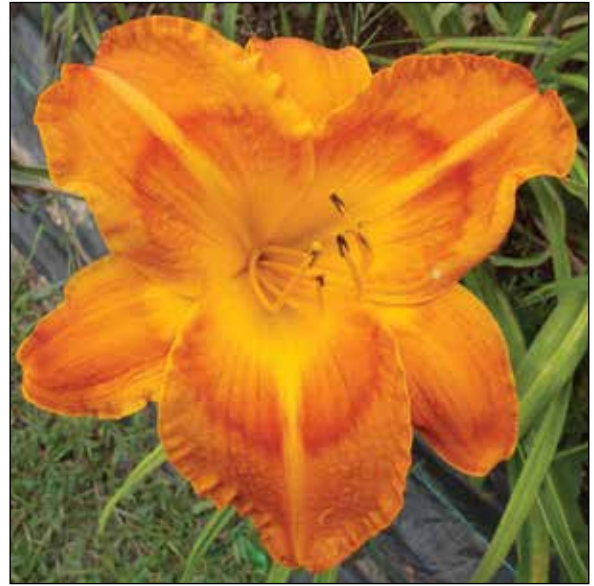
H. 'Jambalaya' (Soules 1981)

a 21", 4" pink, orange, and lavender blend with a purple eyezone and a green throat, won an HM in 1986. Two additional diploids also received honors: 'Royal Charm' (1988), a 16", 3.37" Egyptian buff edged wine grape with a wine grape halo and a lime green throat, won an HM in 1994; and 'Porcelain Ruffles' (1990), a 23", 5.5" ivory with pink overlay and a chartruse throat, won an HM in 1996. Another popular diploid, 'Inca Toy' (1990), a 20", 3.25" yellow cream blend edged rosy mahogany with a yellow green throat, remains overlooked, as does 'Swingin' Miss' (1990), a 22", 3.25" rose red diploid with white midribs and yellow throat.