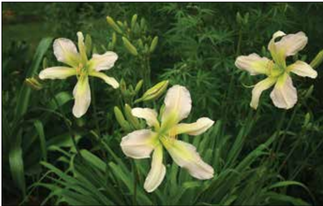
H. 'Asterisk' (Lambert 1985)