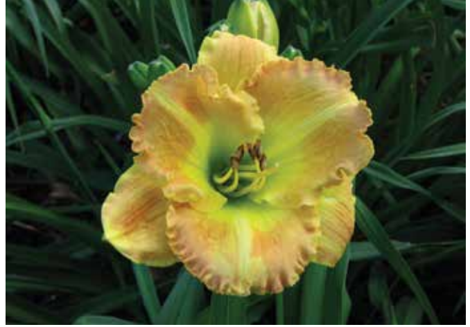
H. 'Smuggler's Gold' ( Branch ) Tet: 24", 6" HM 1997, AM 2002