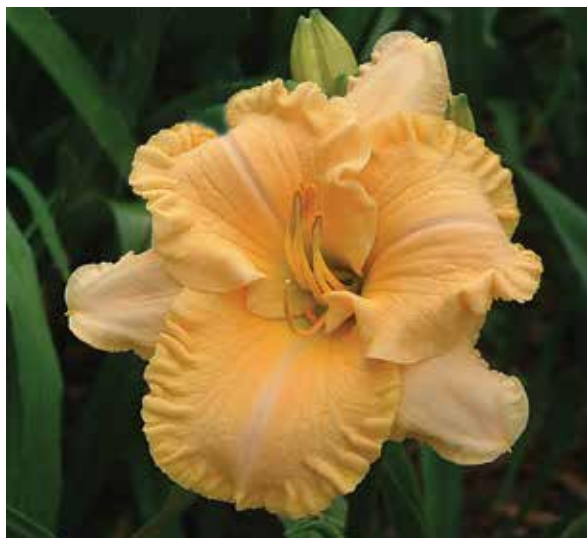
H. 'Good Morning America' (Salter) Tet: 26", 6"; HM 2005