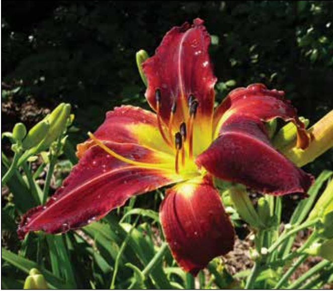
H. 'Samar Star Fire' (Sullivan 1985)