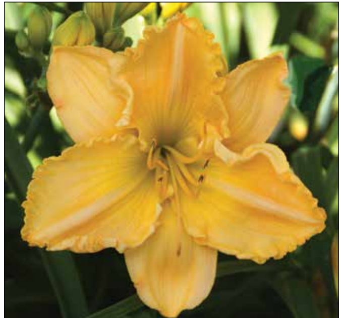
H. 'Josephine Marina' (J. Carpenter 1987)

'Regal Heir' (1987), a 22", 5.5" purple self with a yellow green throat, won the President's Cup at the National Convention in 1992, but again no further awards. 'Josephine Marina' (1987), a 21", 7.5" apricot peach self with an olive green throat, won an HM in 1990 and an AM in 1993. 'Marie Hooper Memorial' (1988), a 26", 8.25" melon pink blend with yellow green throat, won an HM in 1998. 'Ruffled Perfection' (1989), a 24", 7" lemon yellow self with a green throat, won an HM in 1997 and an AM in 2000. 'Dark and Handsome' (1990), a 20", 5.75" smoky pink with a dark maroon eyezone and a yellow green throat, won an HM in 1997. 'Merle Kent