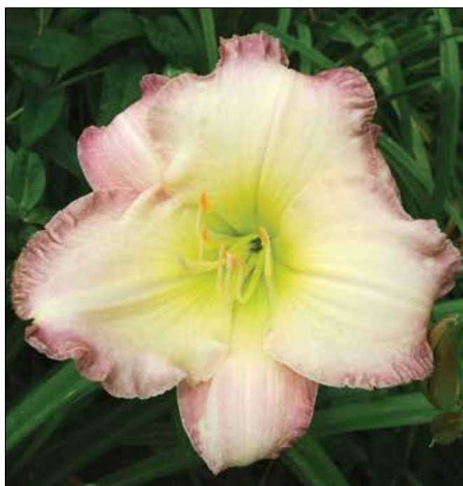
H. 'Seal of Approval' (Santa Lucia 1990)