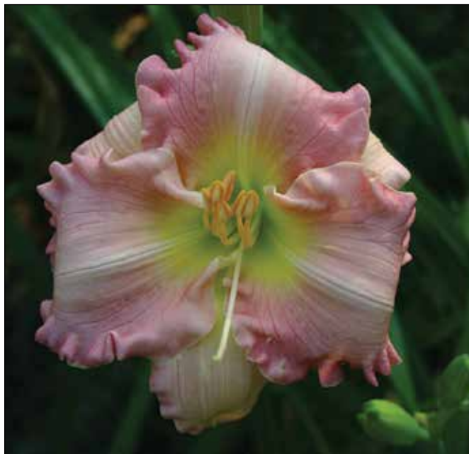
H. 'Neal Berrey' (Sikes 1985)