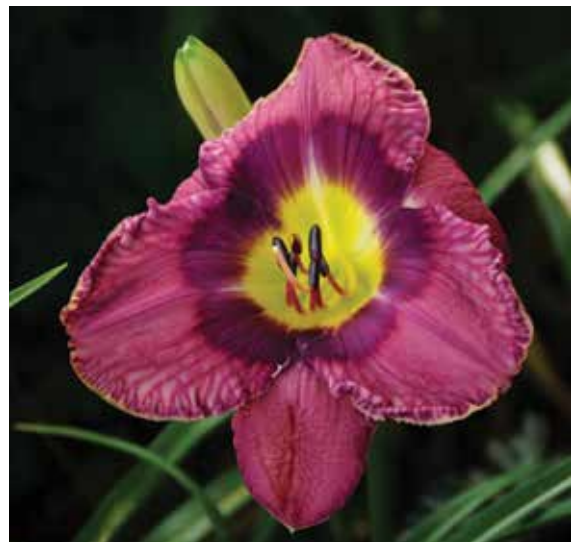
H. 'Rhine Maiden' (Morss) Tet: 28", 6"; HM 1996