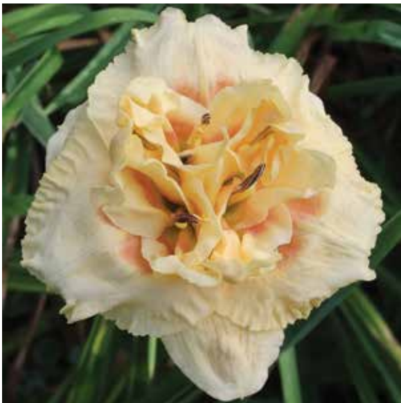
H. 'Siloam Peony Display' ( P. Henry ) Dip: 18", 6" double; HM 1995