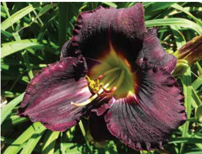
H. 'Black Ambrosia' (Salter) Tet: 28", 5"; HM 1999, AM 2003