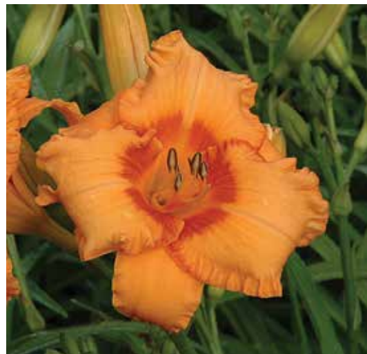
H. 'Cherry Eyed Pumpkin' (D. Kirchhoff) Tet: 28", 5.75"; HM 1995