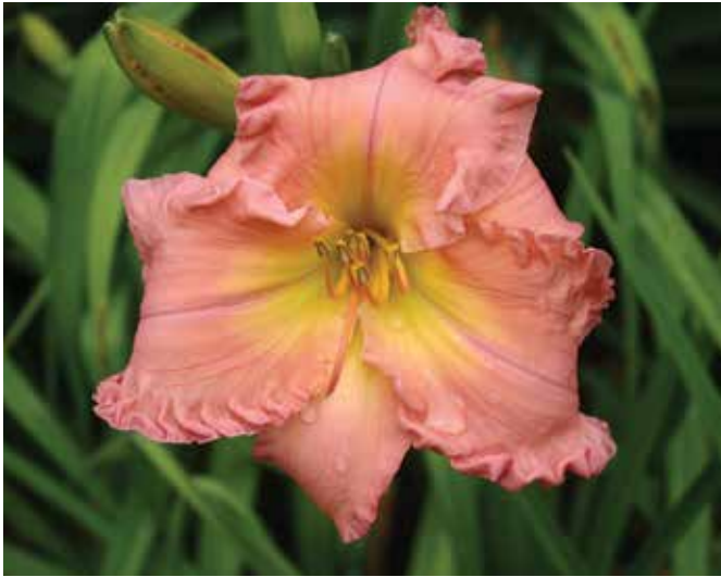
H. 'Tahitian Waterfall' (Billingslea) Dip: 26", 5.5"; HM 1996