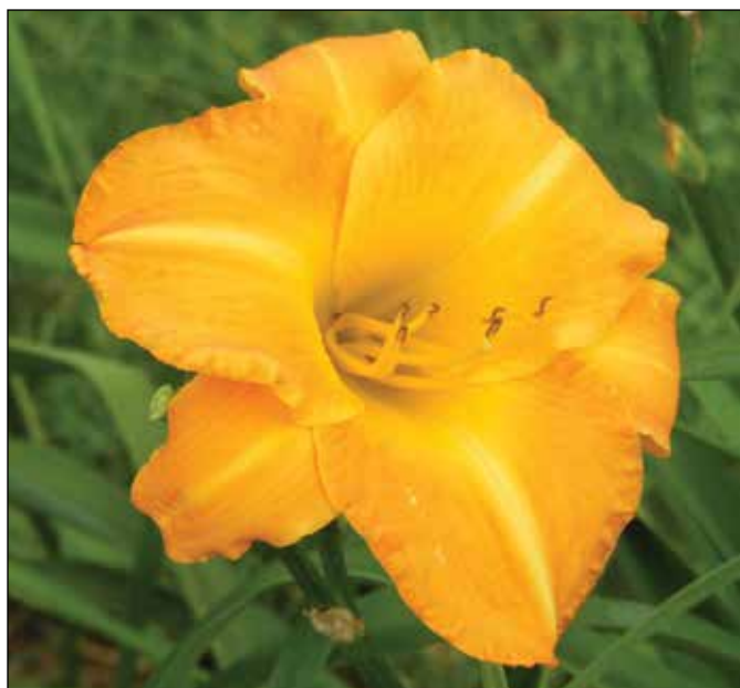
H. 'Carrot' (Edgar W. Brown 1985)

'Sunshine Magic' (1981), a 23", 7" gold self with a green throat, won an HM in 1987. Another tetraploid, 'Firepower' (1984), a 25", 6" barn red self with a green throat, won an HM