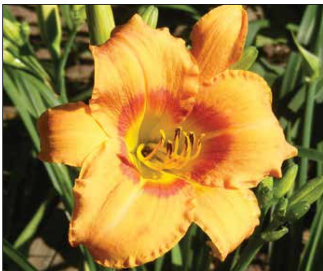
H. 'Caprician Fiesta' (Rogers 1984)