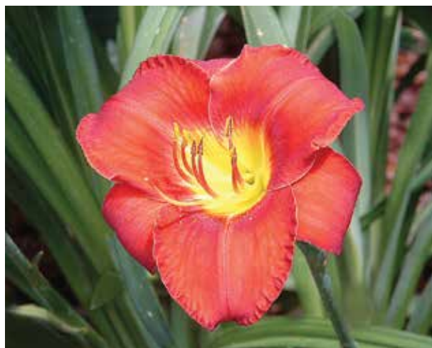
H. 'Sultry Siren' ( L. Gates ) Tet: 25", 6"; HM 1996