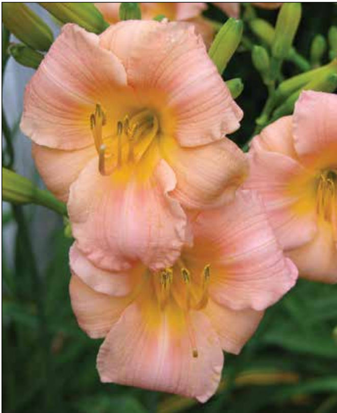
H. 'Promises Promises' (Warner 1981)