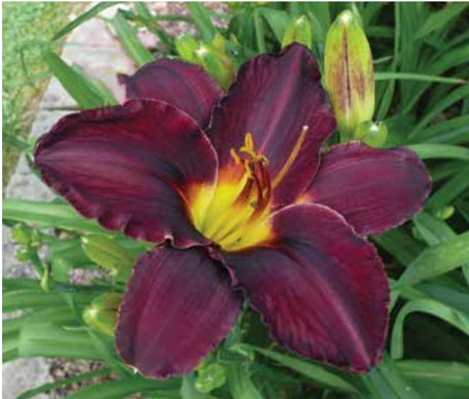
H. 'Derrick Cane' (B. Brooks) Tet: 34", 5"; HM 1995