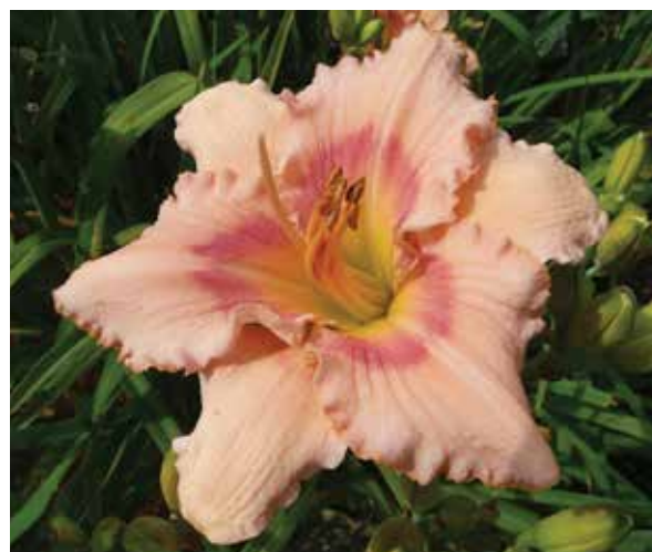
H. 'Pink Cotton Candy' ( Stamile ) Tet: 23", 5"; HM 1995