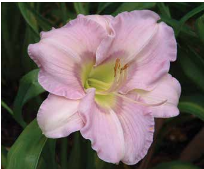
H. 'Lavender Layette' (Spalding 1988)