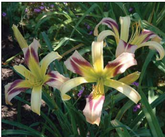
H. 'Rainbow Spangles' (Temple 1983)