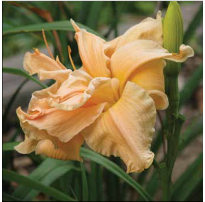
H. 'Scatterbrain' (Joiner 1988)