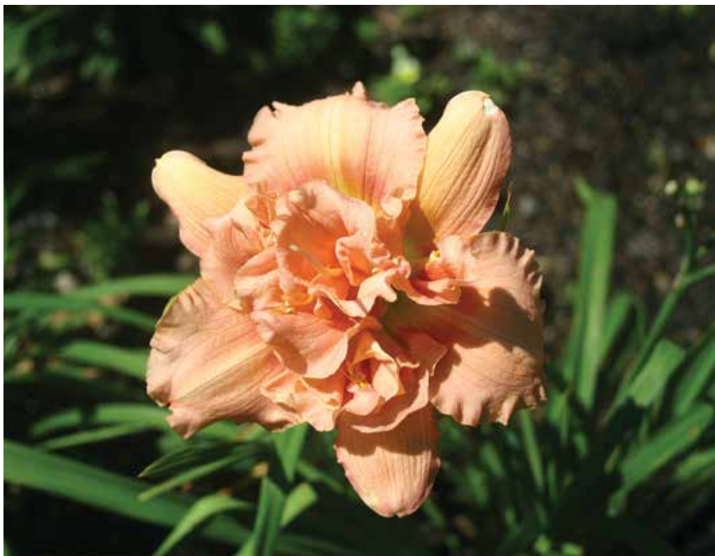
H. 'Yazoo Jim Terry' (Smith-Barfield) Dip: 20", 6" double; HM 2005