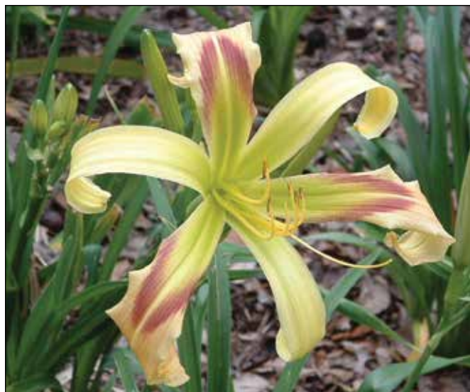
H. 'Mountain Top Experience' (Temple 1988)