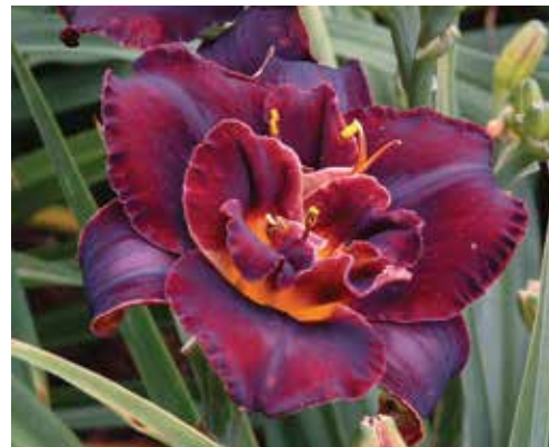
H. 'Ezekiel' (Talbot) Tet: 28", 5" double; HM 1995