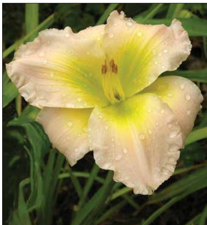
H. 'Pastel Classic' (Millikan-Soules 1985)