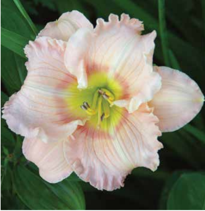
H. 'Molino Pink Loveliness' (McCord) Dip: 18", 5.5"; HM 1997