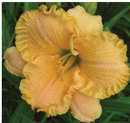
H. 'Lady Arabella' (Salter) Tet: 28", 5"; HM 1999