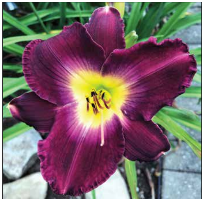
H. 'Strutter's Ball' (Moldovan 1984)

'Vera Biaglow' (1984), a 28", 6" rose pink edged silver with a lemon green throat, captured an HM in 1989 and an AM in 1993. 'Pewter Lake' (1986), a 28", 6" gray bluish lavender blend with deeper veins and a lemon yellow green throat, won an HM in 1991. 'Avante Garde' (1986), a 26", 5.5" amber tan bitone with a red orange eyezone and a yellow green throat, won an HM in 1993, and 'Geppetto' (1986), a 26", 5" pink cream with a strong pink eyezone and yellow green throat, won an HM in 1994. Four other tetraploids, registered on the cusp of the next decade, are worth mentioning. 'Anchors Aweigh' (1990), overlooked for awards, is a 28", 6" bluish violet blend