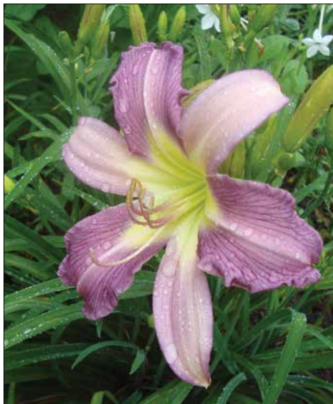
H. 'Moonlight Orchid' (Talbot 1986)