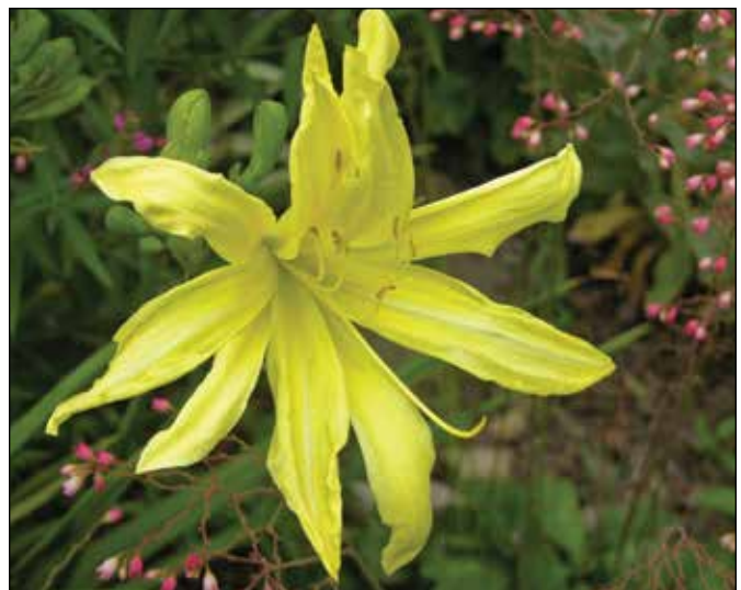
H. 'Four Star' (Kropf-Tankesley-Clarke 1988)