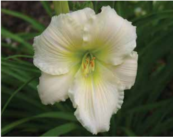
H. 'Southern Tradition' (Wall) Dip: 30", 5.5"; No Awards