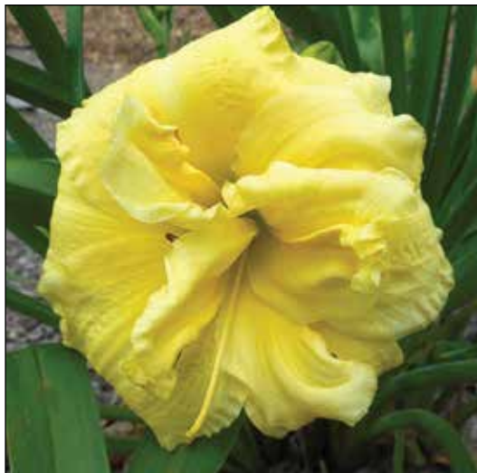
H. 'Cabbage Flower' (Kirchhoff-D. 1984)