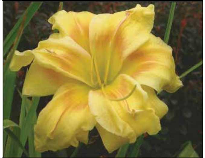
H. 'Double Pop Art' (Betty Brown 1981)

During the historical period of the 1970s and 1980s, Betty B. Brown of Orange, Texas, had great success in hybridizing diploid doubles. H. 'Double Overtime' (1981), a 19", 6" peach tan with a wine eyezone and green throat, won an HM in 1986. 'Whopper Stopper' (1981), a 24", 6" rose with a wine eyezone and chartreuse throat, won an HM in 1988. 'Double Tour Time' (1981), a 23", 6" peach self, won an HM in 1992. However, 'Double Pop Art' (1981), a 22", 5" double yellow with a light wine eyezone and a yellow throat, remains overlooked, as does 'Double Purple Thrill' (1981), a 15", 5.5" double deep purple self with a light gold throat. 'Double