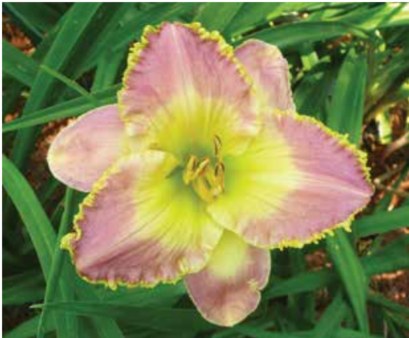
H. 'Spritual Corridor' (C. Hanson) Tet: 25", 6"; HM 1997