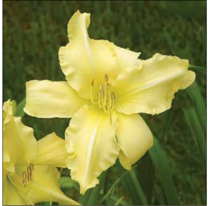
H. 'Twirling Skirt' (Carpenter-Glidden 1984)