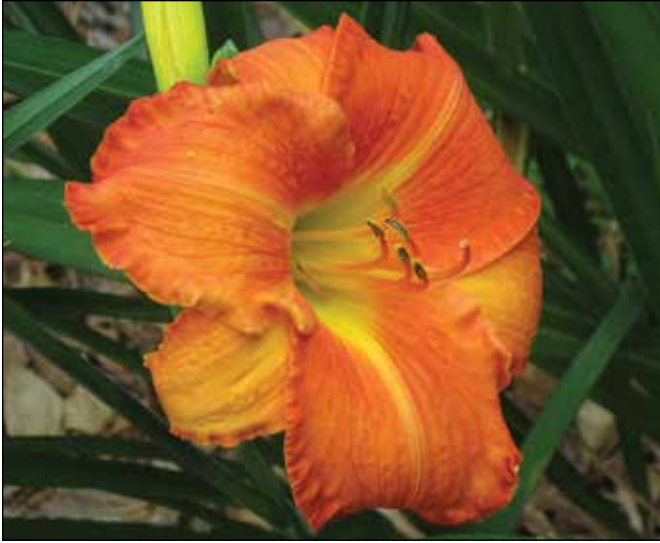
H. 'Old Tangiers' (Millikan 1985)