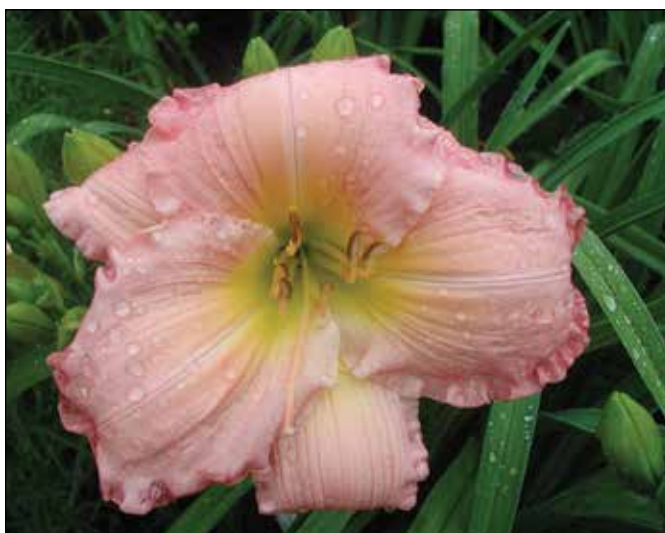
H. 'Xia Xiang' (Billingslea 1988)