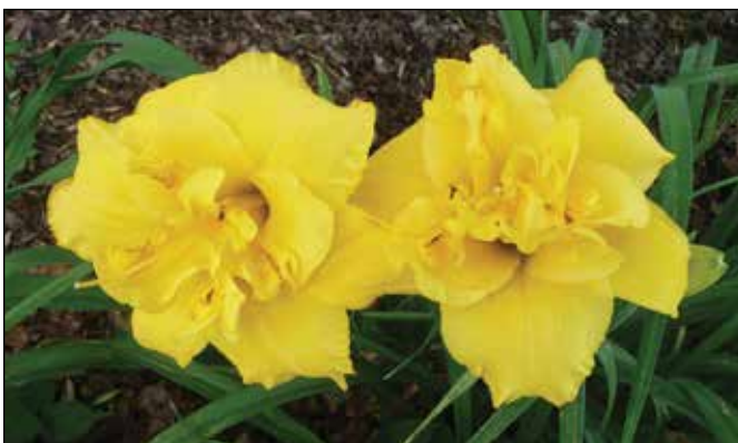
H. 'Layers of Gold' (Kirchhoff-D. 1990)