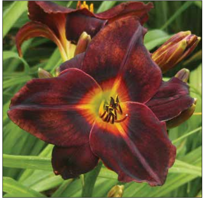
H. 'Total Eclipse' (Durio-D. 1984)

HM in 1996. His tetraploid, 'Double Dipper' (1990), a 28", 6.5" double tangerine and melon pink blend with a rose rouge halo above a green chartreuse throat, remains overlooked.