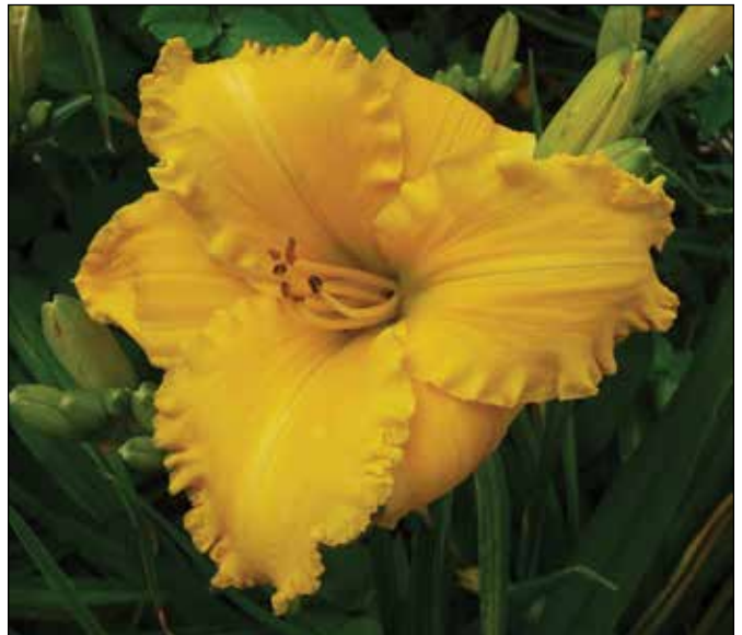
H. 'Olympic Showcase' (Stamile 1990)