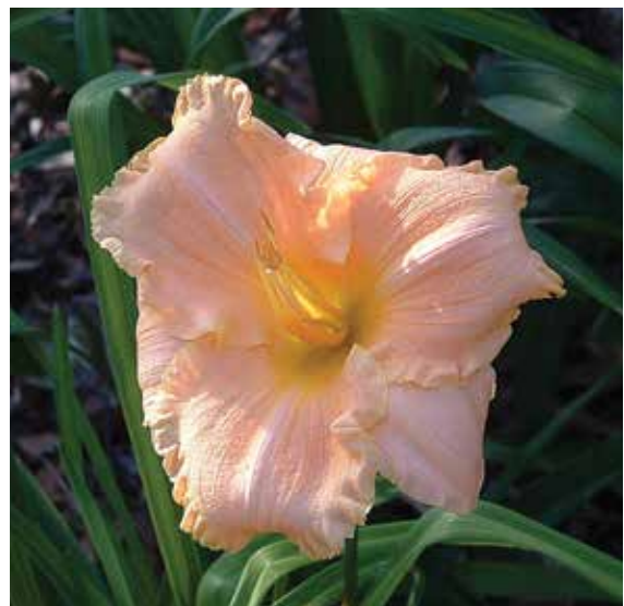
H. 'Tears of Love' (Shooter) Dip: 28", 5.5"; HM 2006