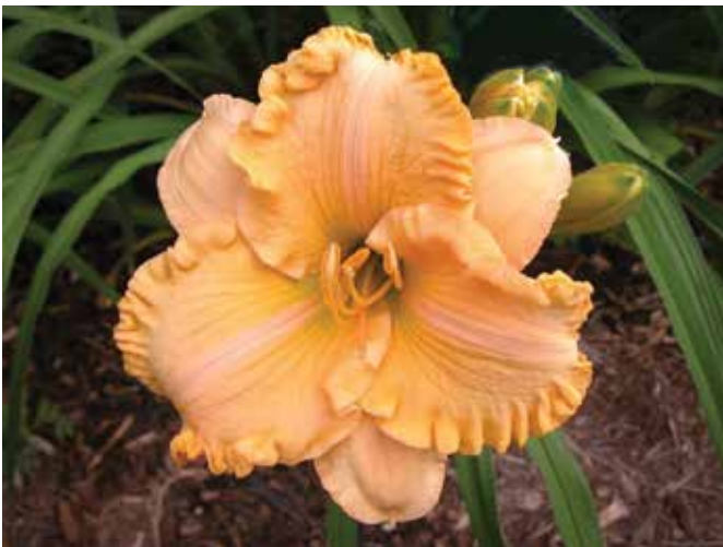
H. 'Alexandra' (Salter) Tet: 24", 5.5"; HM 1997