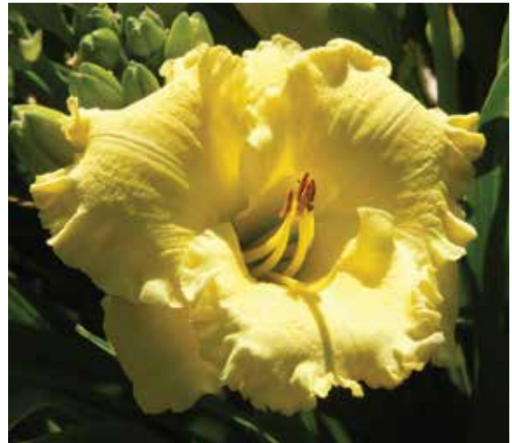
H. 'Emperor's Choice' (Benz) Tet: 24", 5"; HM 1998