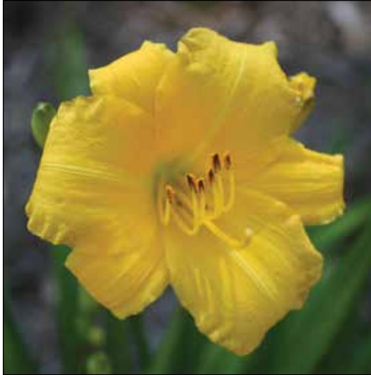
H. 'Yellow Lollipop' (Crochet 1980)