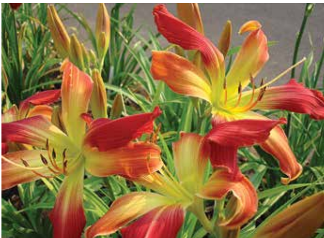
H. 'Hot Wheels' (Calhoun) Dip: 36", 8.5" spider ratio 5.50:1; No Awards