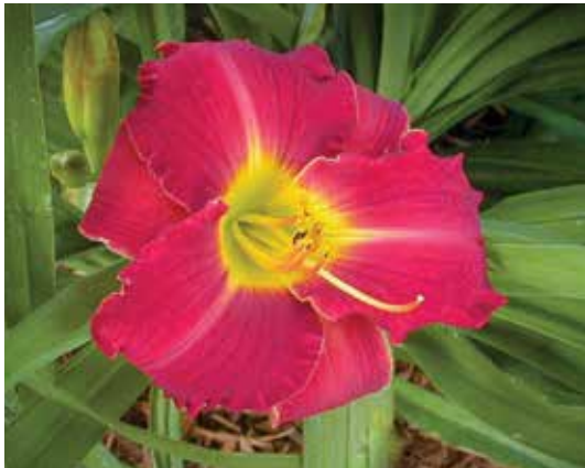
H. 'Obsession in Red' ( D. Kirchhoff ) Tet: 28", 4.5"; HM 1994