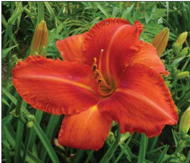
H. 'Alabama Jubilee' (Webster 1988)

24", 5" bright red self with a green throat, won an HM in 1992. 'Roll Tide' (1987), a 26", 5.5" bright red self with a small green throat, won an HM in 1996. 'Alabama Jubilee' (1988), a 30", 7" fluorescent red orange with a brighter red halo, won an HM in 1993. However, 'Centerpiece' (1988), a 26", 6.5" vivid orange yellow with a deep purple eyezone, and 'Risen Star' (1988), a 26", 10" soft yellow unusual form crispate with a greenish yellow throat, remain overlooked, as does 'Exotic Dancer' (1989), a 28", 7.5" pink unusual form crispate with a green throat. 'Red Suspenders' (1990), a 32", 11" bright red unusual form crispate with a chartreuse green throat, won an HM in 1995 and came the closest of any of these to winning an AM, missing by one vote.