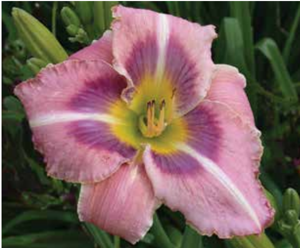
H. 'Last Flight Out' (Hansen) Tet: 22", 6"; HM 2000