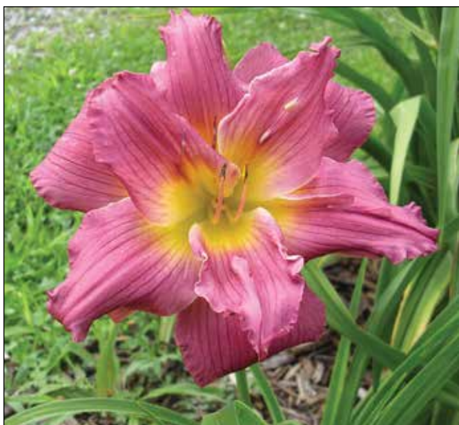
H. 'Amethyst Art' (Kropf 1988)