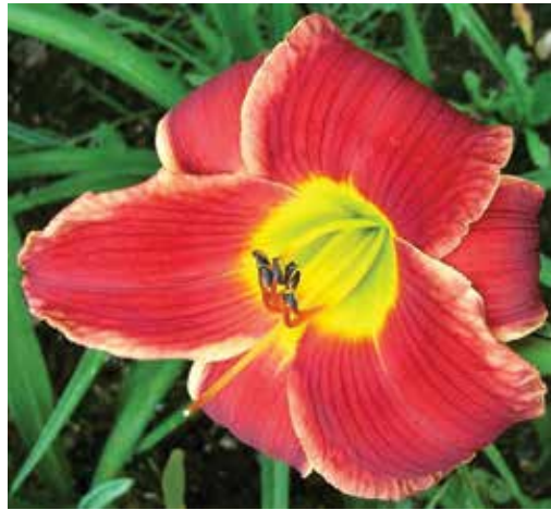
H. 'Street Urchin' D. Kirchhoff) Tet: 25", 5.5"; HM 1998