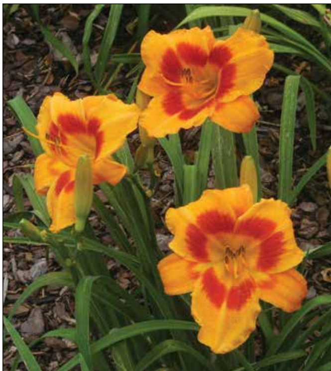
H. 'Eye-yi-yi' (McCroskey 1988)