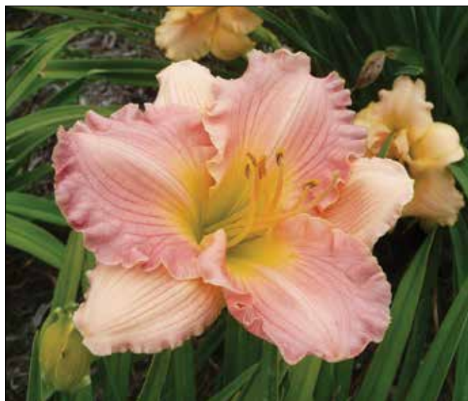
H. 'Blessing' (Applegate 1989)