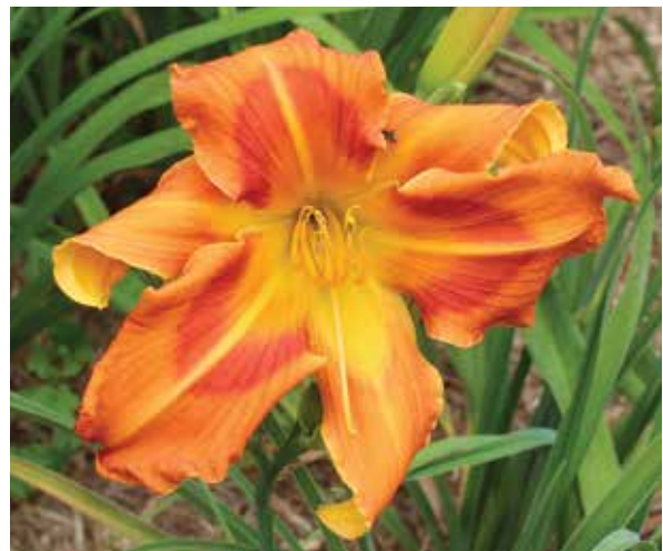
H. 'Orangutan' ( Reed ) Dip: 26", 6"; HM 2003