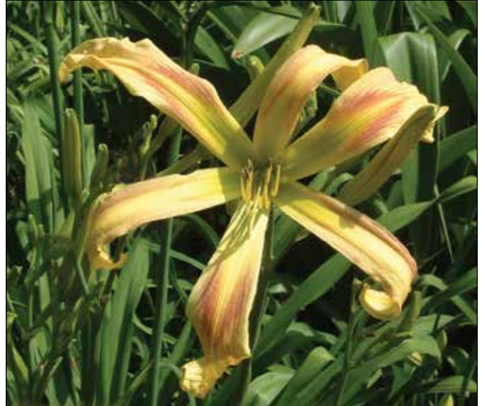
H. 'Slender Lady' (Crandall 1987)

yellow amber self with a very green throat and a spider ratio of 5.00:1, won an HM in 1997. 'Satan's Curls' (1987), a 29", 6" unusual form crispate red with a yellow band outside a very green throat, was popular, but also overlooked for an award. In contrast, 'Calico Spider' (1987), a 32", 6.75" gold with a brown mahogany eyezone and a spider ration of 4.20:1, eventually won an HM in 2011.