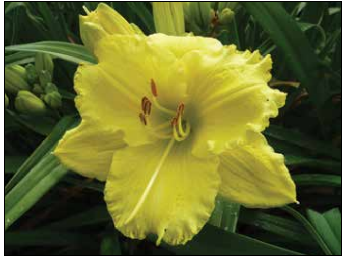
H. 'Floyd Cove' ( Stamile 1987)