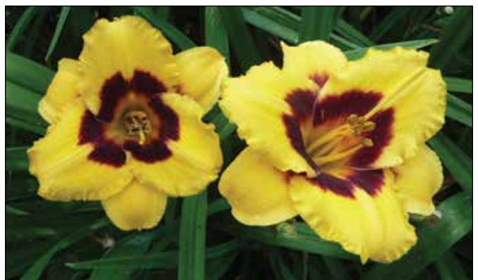
H. 'Blackberry Candy' (Stamile 1989)