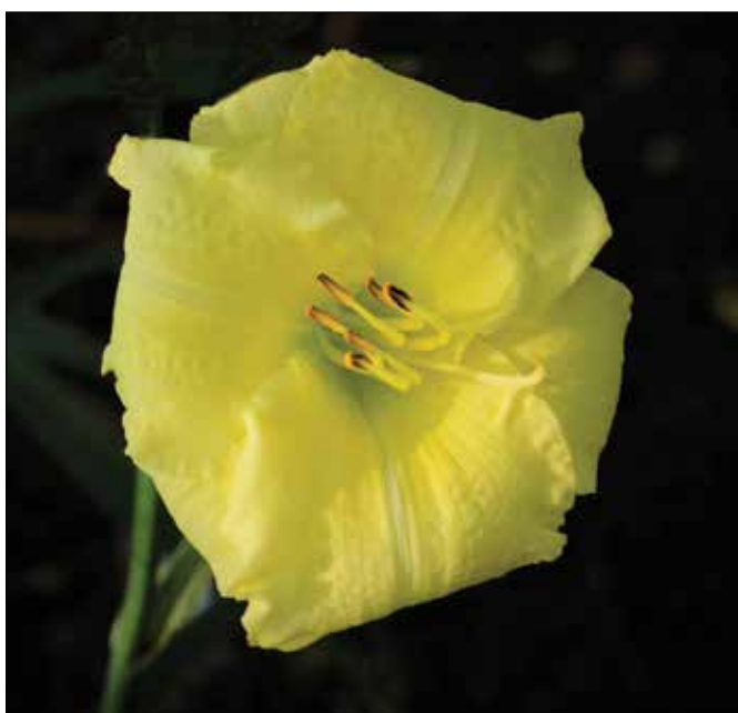
H. 'Marble Faun' (Millikan 1983)

green throat, won an HM in 1990. Another tetraploid, 'Old Tangiers' (1985), a 28", 5" tangerine with red eyezone and chartreuse throat, won an HM in 1993. Among other diploids, 'Snowed In' (1985), a 25", 5.5" white with light green overlay and a green throat, won an HM in 1991; 'Green Eyed Lady' (1985), a 24", 4.5" yellow green self with a green throat, won an HM in 1991; 'Video' (1985), a 20", 5" lemon yellow self with a green throat, won an HM in 1992; 'Carlotta' (1986), a 25", 4.5" blend of red and cherry pink with cream midribs and a green throat, won an HM in 1993; 'Chantelle' (1988), a 24", 4.5" bright pink with lighter midribs and green throat, won an HM in 1993; and 'Camay' (1989), a 20", 4.5" rich medium pink self with a very green throat, won an HM in 1995. Millikan registered several daylilies in conjunction with