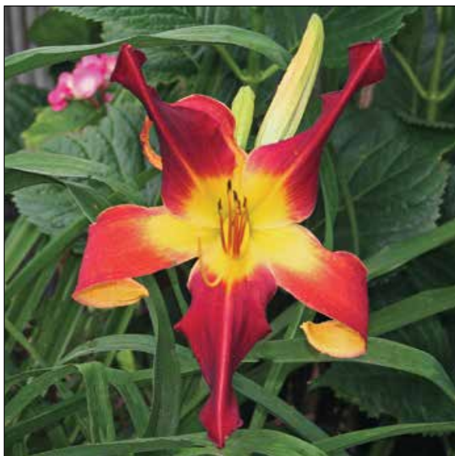
H. 'Red Suspenders' (Webster 1990)