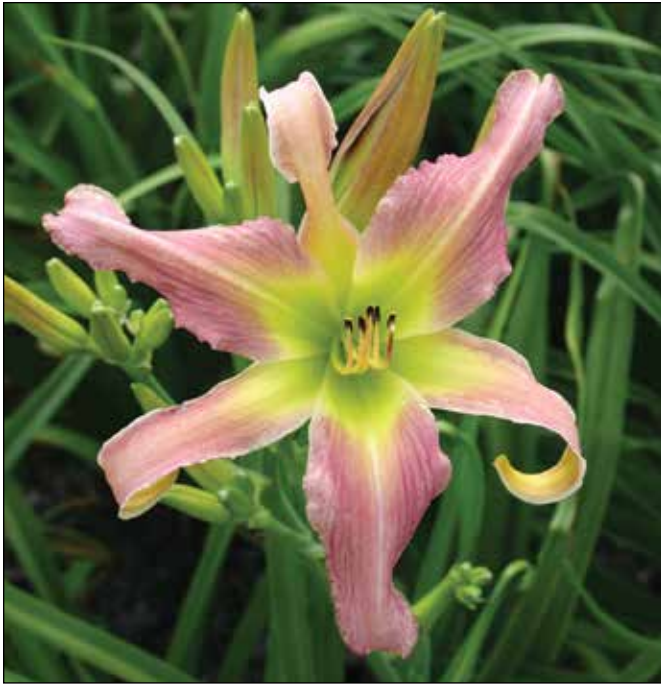
H. 'Exotic Dancer' (Webster 1989)