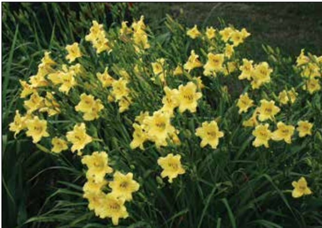
H. 'Toy Trumpets' (Sobek 1984)