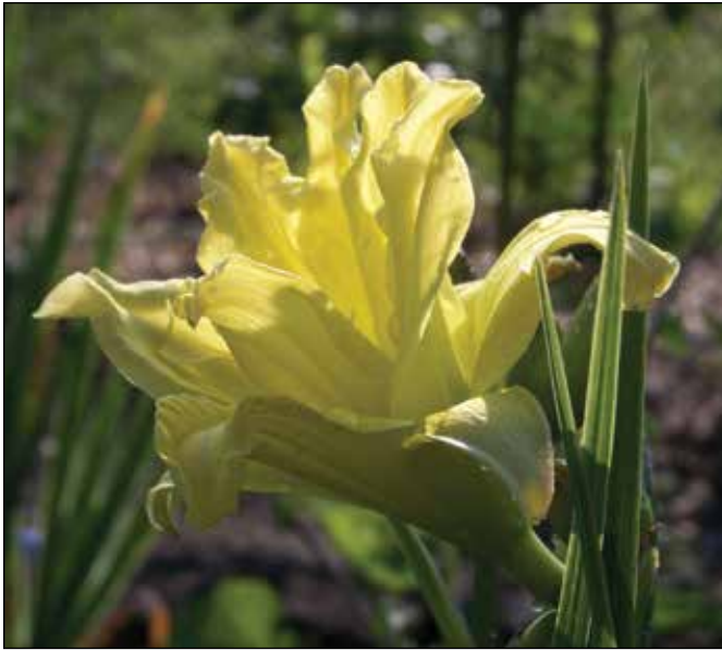
H. 'Double River Wye' (Kropf 1982)