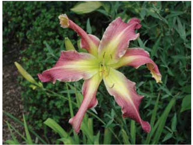
H. 'Chin Whiskers' (McRae) Dip: 20", 5", unusual form crispate; No Awards