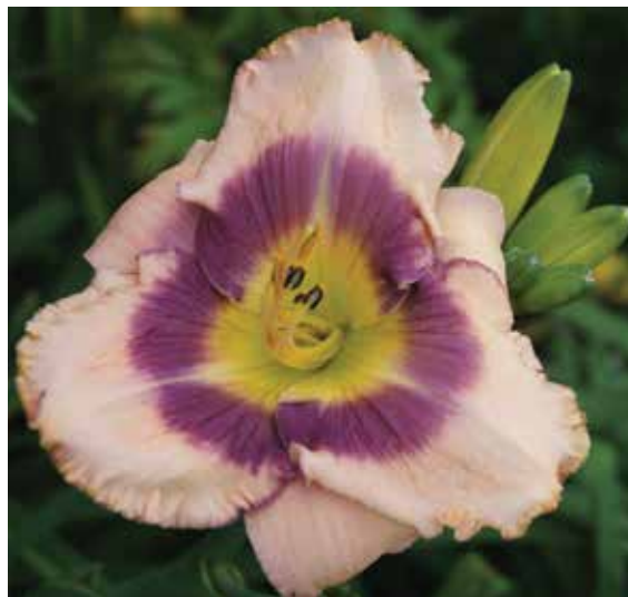
H. 'Medieval Splendor' (Salter) Tet: 28", 6.5"; HM 1999