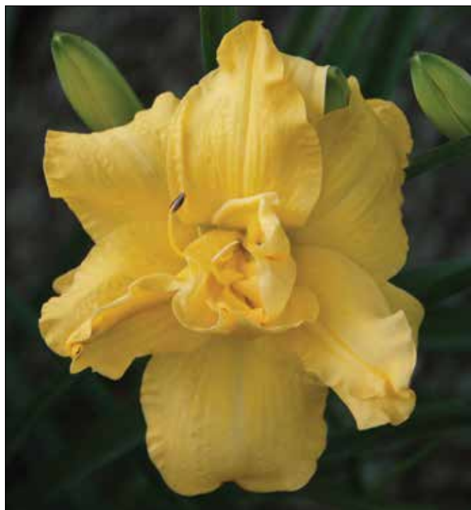
H. 'Rachael My Love' (Talbot 1983)

1987. 'Rachael My Love' (1983) an 18", 5" golden yellow double, won an HM in 1988 and an AM in 1991, having won the Ida Munson Award for doubles in 1989. 'Hamlet' (1984), an 18", 4" purple with a deep purple eyezone and a green throat, won an HM in 1987 and the JEM in 1988. 'Femme Fatale' (1985), a 21", 5" creamy tangerine with a purple eyezone and green throat, won an HM in 1985. 'Ra Hansen' (1986), a 28", 4.75" dark orchid lavender with variegated blue powder shading and a green throat, won an HM in 1990. 'Moonlight Orchid' (1986), a 28", 6.5" blue lavender with a light blue eyezone and green throat, won an HM in 2001. 'Vi Simmons'