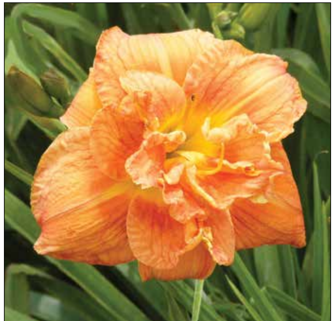
H. 'Double Dipper' (Durio-D. 1990)