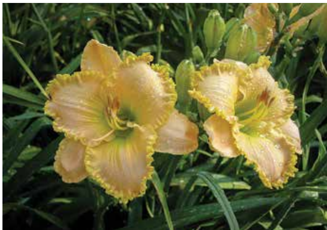
H. 'Something Wonderful' ( Salter ) Tet: 28", 5"; HM 1997, AM 2002