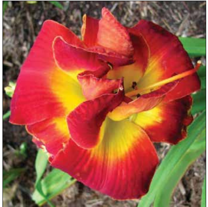
H. 'Red Explosion' (Sellers 1986)

'Charm' (1986), a 26", 4" pale pink diploid with a pink halo and green throat, won an HM in 1993, and a diploid double, 'Red Explosion' (1986), a 26", 5.5" red with a yellow green throat, won an HM in 1994. Two of his most honored diploids were 'Exotic Echo' (1984), a 16", 3" pink cream blend double with a burgundy eye and a green throat, which won an HM in 1989, the Annie T. Giles Award for small flowers in 1994, and an AM in 1994; and 'Big Apple' (1986), a 26", 5" cerise red self with a green throat, which won an HM in 1989 and an AM