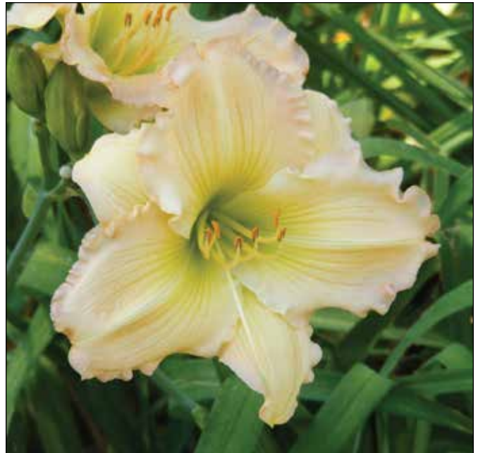
H. 'Stop the Show' (Gates-L. 1986)

green throat, in 1992; 'Stop the Show' (1986), a 24", 6.5" lavender pink and yellow polychrome with a green chartreuse