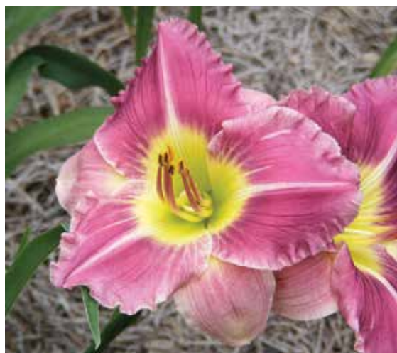
H. 'Elly Launius' (L. Gates) Dip: 26", 6"; HM 1998