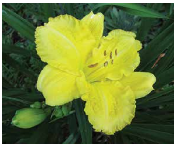
H. 'Yellow Explosion' ( Oakes ) Dip: 27", 5.5"; HM 2011