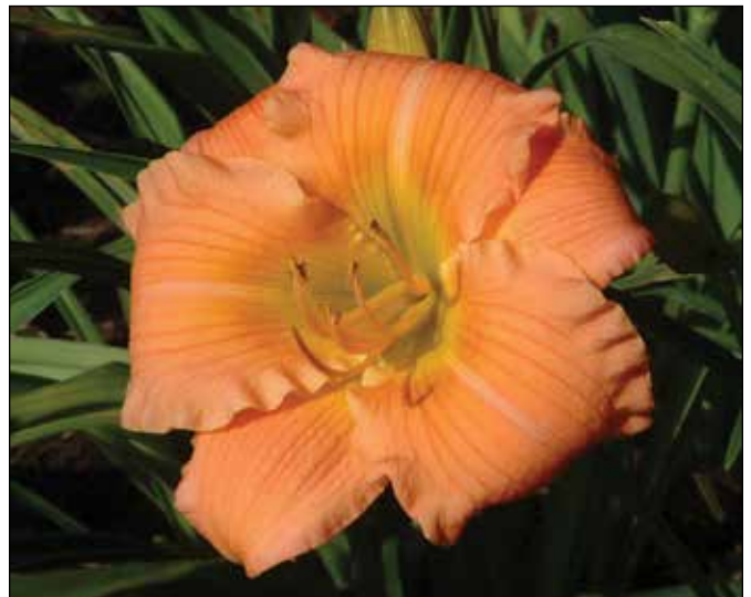
H. 'Kiowa Sunset' (Guidry 1990)