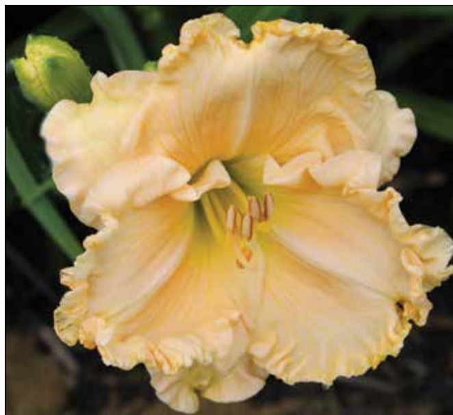
H. 'Ruffled Masterpiece' (Brown-E.C. 1987)

eyezone above a yellow halo and a green throat, won an HM in 1991 and an AM in 1994. 'Elegance Supreme' (1987), a 19", 5" creamy near white self with a green throat, won an HM in 1993. 'Rose Charmer' (1987), a 23", 5.5" rose pink self with a green throat, won an HM in 1994. 'Ruffled Masterpiece' (1987), a 24", 5.25" creamy yellow self with a green throat, won an HM in 1995. 'Queen's Memories' (1989), a 25", 6" cream white self with a green throat, won an HM in 1993. 'Purple Rain Dance' (1989), a 29", 5.25" deep purple self with a green throat, won an HM in 1994. 'Rose Time' (1989), a 26", 5.25" rose pink self, also won an HM in 1994. 'Pink Tranquility' (1990), a 26", 5.5" cool clean pink self with a green throat, won an HM in 1995. In all, Edwin C. Brown is credited with 102 registrations, most of them diploids, though he registered several tetraploids after the historical period. He received the Bertrand Farr Silver Medal in 2004.