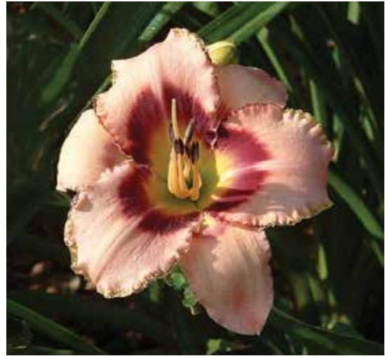
H. 'Oliver Dragon Tooth' ( Morss ) Tet: 20", 4.25"; HM 1999