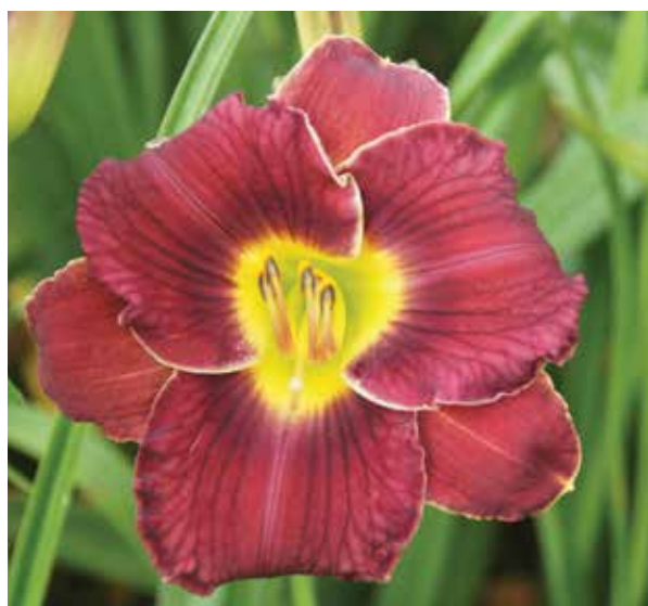
H. 'Rue Madelaine' (Carr) Tet: 27", 5.5"; HM 1996