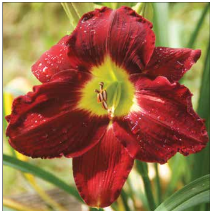
H. 'Big Apple' (Sellers 1986)