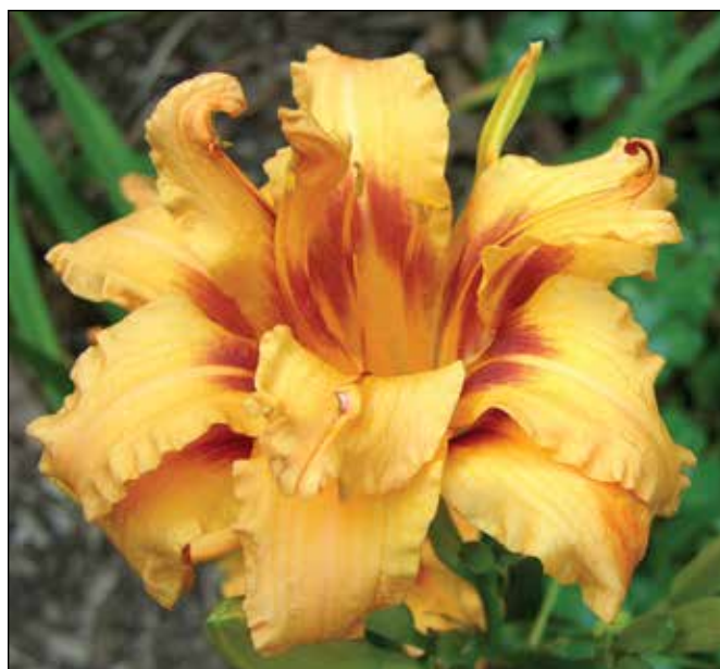
H. 'Carrot Crest' (Kropf 1990)