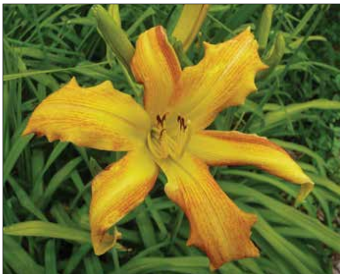
H. 'Spinneret' (Tankesley-Clarke 1990)