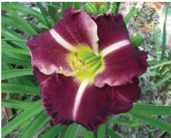
H. 'Purple Sand Dollar' (E.C. Brown) Dip: 19", 4.75"; HM 2003