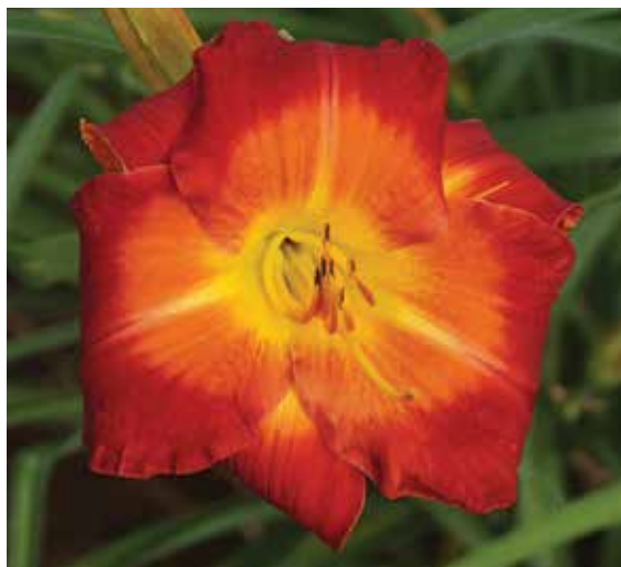
H. 'Magic Carpet Ride' ( D. Kirchhoff ) Tet: 28", 6"; HM 1996, AM 1999