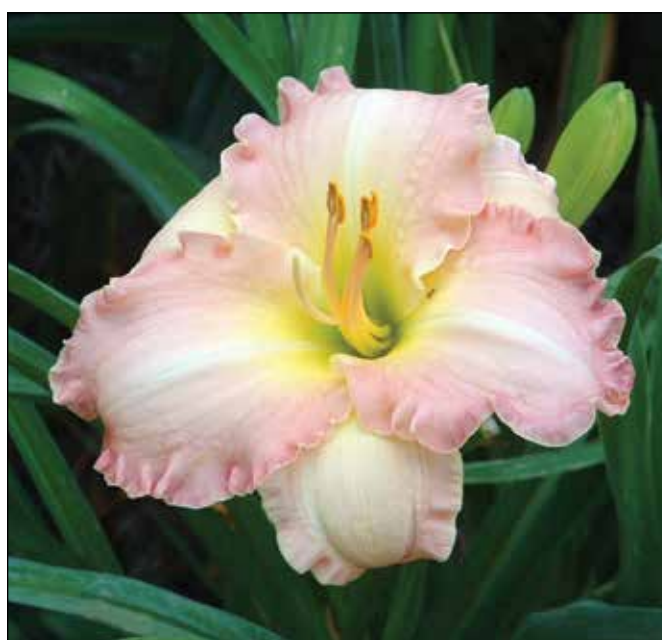
H. 'Antique Rose' (Sikes 1987)