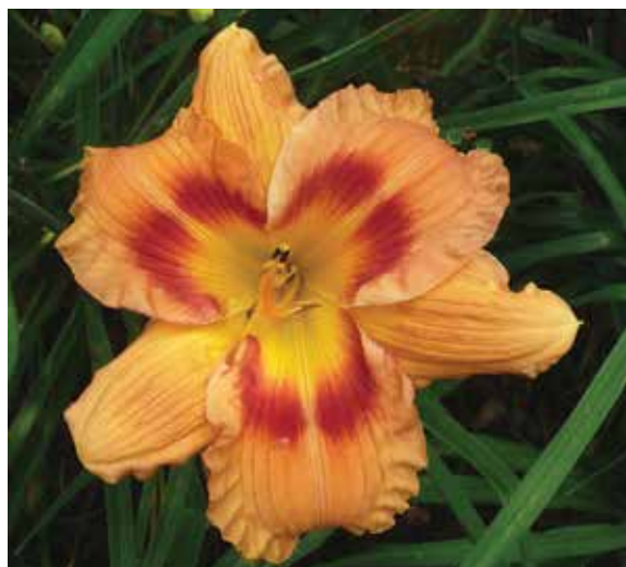
H. 'Cinnamon Sunrise' (Copenhaver) Dip: 25", 6.5"; HM 2000