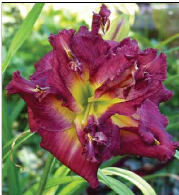
H. 'Desdemona' (Kirchhoff-D. 1984)