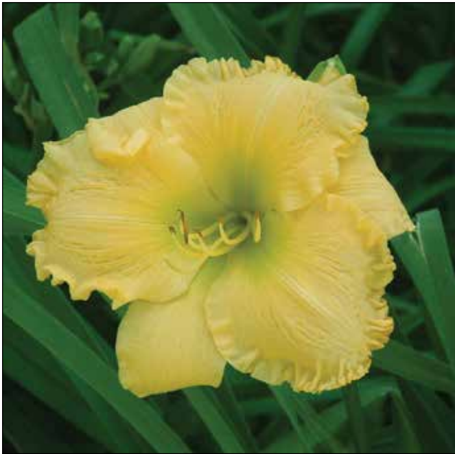
H. 'Alec Allen' (Kate Carpenter 1982)

with an olive green throat, in 1984; 'Vision of Beauty' (1985), a 21", 6" very light pink with a lavender pink halo and green throat, in 1990; and 'Unique Style' (1985), a 21", 3.25" yellow edged rose amber and greenish yellow bicolor with a large green throat, in 1992. Kate Carpenter was awarded the Bertrand Farr Silver Medal in 1994.