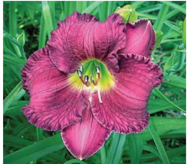
H. 'Solomons Robes' ( Talbott ) DIP: 30", 6"; HM 1995, AM 1998