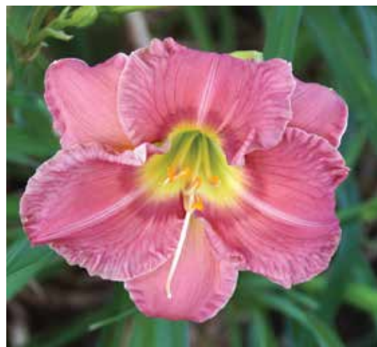
H. 'Fair Kelly Michelle' (Wall) Dip: 24", 5"; HM 1997