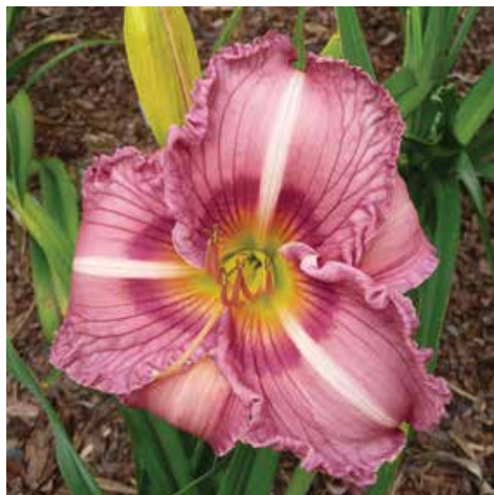
H. 'Jedi Little Mike' (Wedgeworth) Dip: 26", 5"; HM 2003