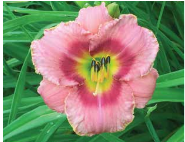
H. 'Sublime Enchantment' (D. Kirchhoff) Tet: 25", 4.25"; HM 1996