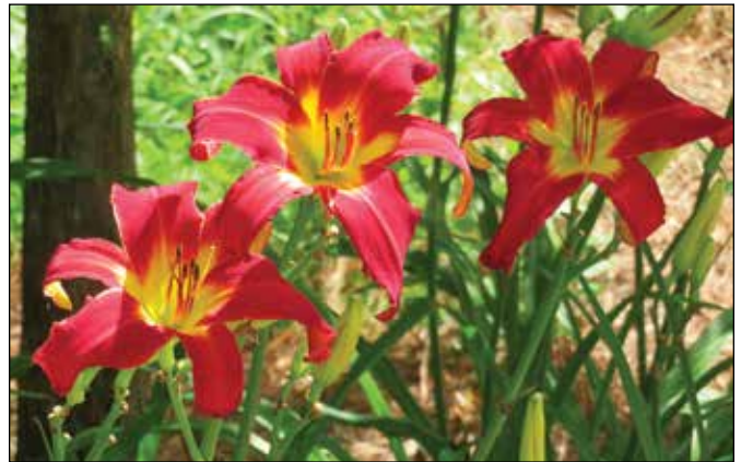
H. 'Spider Man' (Durio 1982)