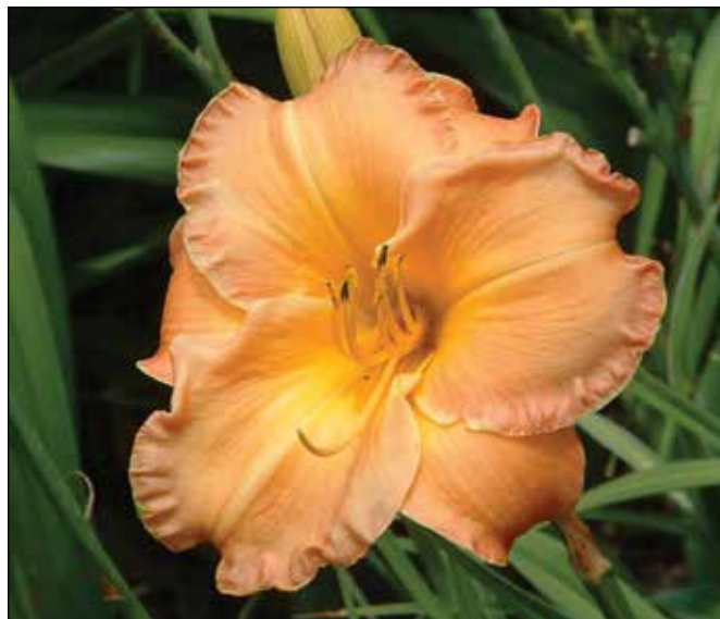
H. 'Clay Basket' (Ford 1989)