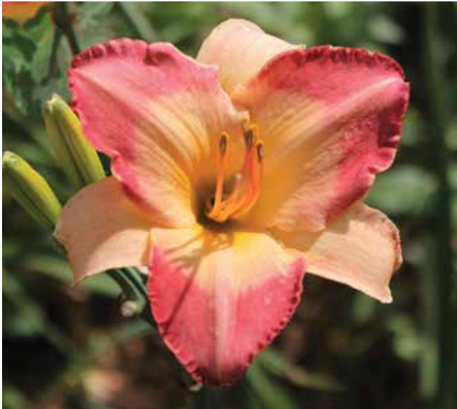
H. 'Cherry Chapeau' (R. W. Munson, Jr. 1983)

purple eyezone and a peach orange throat, won an HM in 1987. 'Sovereign Queen' (1983), a 30", 6" bluish lavender self with a cream throat, won an HM in 2003. 'Apollodorus' (1984), a 28", 4.5" violet purple self with a cream yellow throat, won an HM in 1987. 'Nivia Guest' (1984), a 24", 5" purple self with a yellow green throat, won an HM in 1993. 'Cameroons' (1984), a 28", 5" claret self with a yellow green throat, won an HM somewhat belatedly in 2000. 'Beijing' (1986), a 24", 5" pale flesh self with a cream yellow throat, won an HM in 1990. 'Borgia Queen' (1986), a 26", 5" silver lavender mauve with a slate blue eyezone and a cream chartreuse throat, also won an HM in 1990. 'Emperor Butterfly' (1986), a 28", 5" violet orchid mauve blend with a yellow violet eyezone and a yellow green throat, won an HM in 1993. 'Ruffled Dude' (1986),