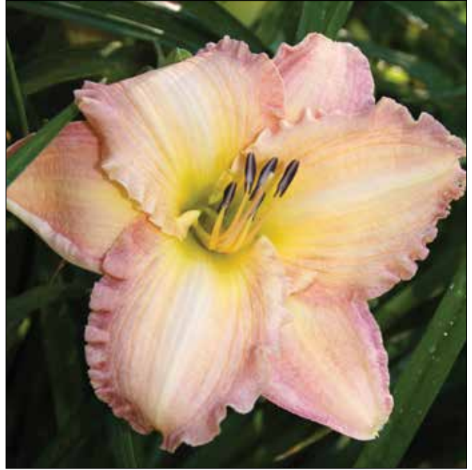
H. 'Princess Ellen' (Crochet 1985)

18", 5.5" cream with a rose border and a green throat, won an HM in 1989. 'Little Red Warbler' (1985), an 18" 3.5" dark red with a maroon eyezone and yellow green throat, won an HM in 1990; 'Pocket Change' (1985), an 18", 4.5" dark red with lighter red edges and a green throat, won an HM in 1993; and 'Candide' (1986), an 18", 3.5" rose salmon and pink blend with a fuchsia eyezone and chartreuse throat, won an HM in 1991. His unusual form crispate 'Pink Windmill' (1987), a 24", 6" spidery pink with a green throat, received an HM in 1994. One of his most famous diploids, 'Ellen Christine' (1987), a 23", 7" pink gold blend double with a dark green throat, won an HM in 1990, an AM in 1993, and the Ida Munson Award for doubles in 1994. His 'Olin Frazier' (1988), a