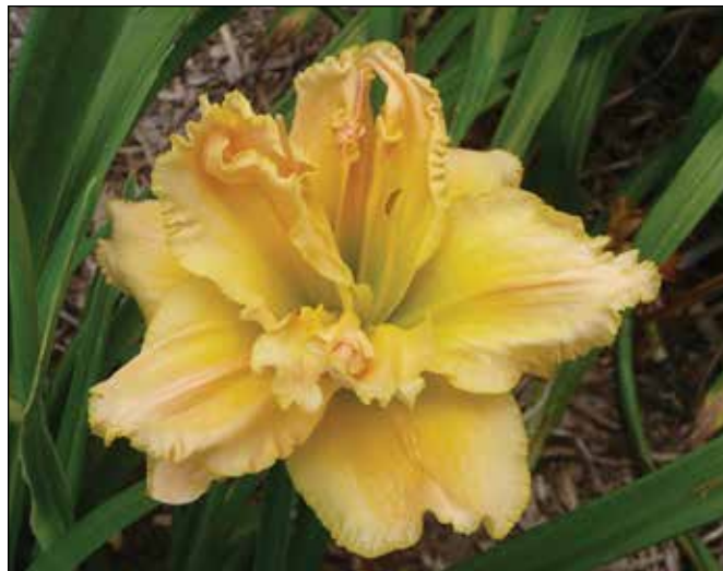
H. 'Fanciful Finery' (Kirchhoff-D. 1984)