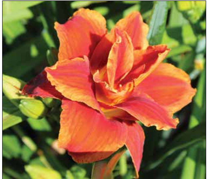
H. 'Fires of Fuji' (Hudson 1990)