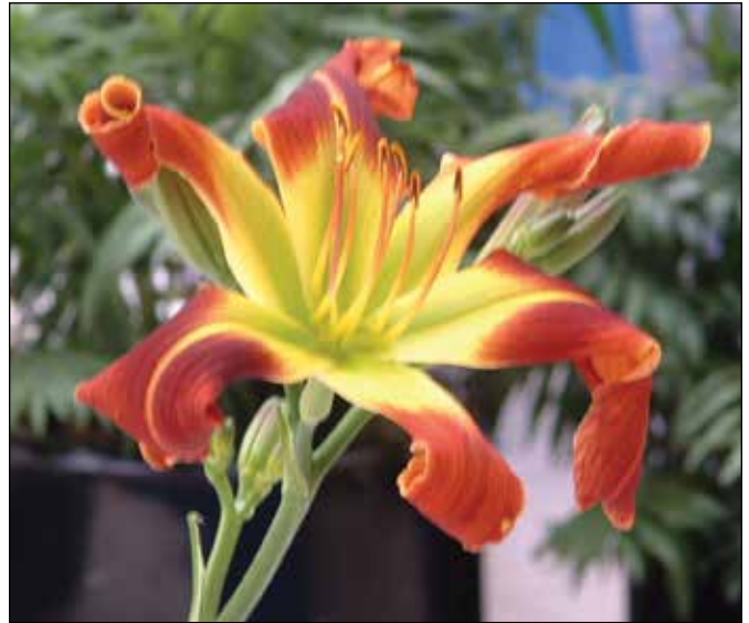
H. 'Satan's Curls' (Crandall 1987)