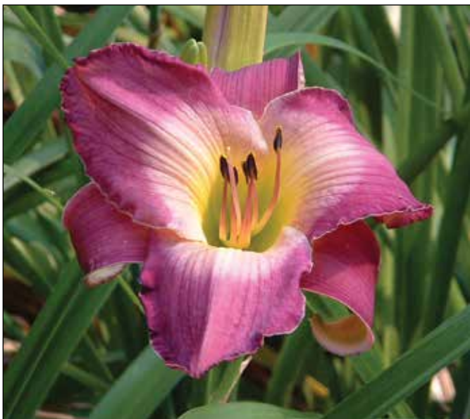
H. 'Nairobi Night' (R. W. Munson, Jr. 1983)

a chartreuse yellow throat, won an HM in 1993. 'Lexington Avenue' (1990), a 24", 6" wine with whitish wine eyezone and a greenish yellow throat, won an HM in 1995. These represent but a fraction of his award winners. Notable among his many cultivars which have not been recognized for awards are 'Nairobi Night' (1983), a 30", 6" purple with a large cream lavender eye above a yellow green throat; 'Nile Plum' (1984), a 20", 5" silvery mauve plum with plum claret eyezone and a yellow green throat; and 'Grand Palais' (1987), a 24", 6" silvery lilac lavender self with a lemon cream throat.