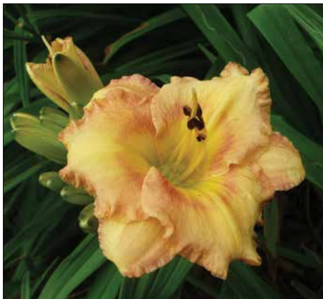
H. 'Inca Toy' (Soules 1990)